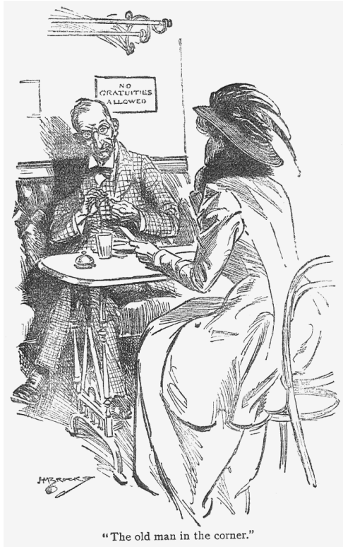
"The old man in the corner."