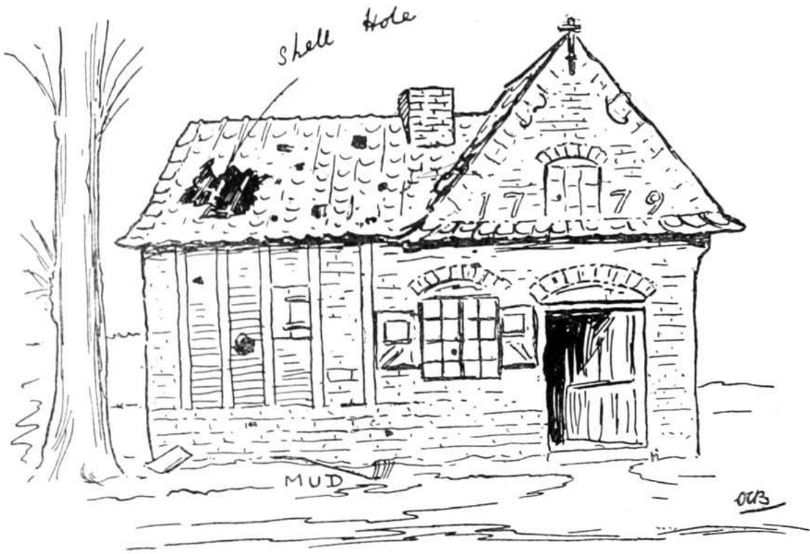
THE C.O.'s HOUSE at - - - 19.12.14