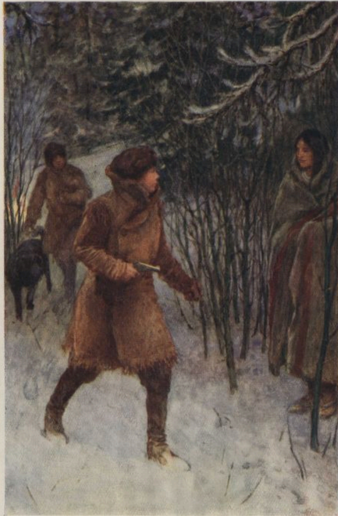
Motionless before her stood a figure wrapped in the usual Indian blanket.