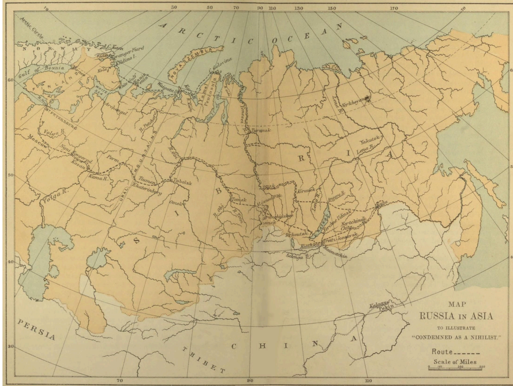
Map of Russian Empire

Of these there were a considerable number on board the steamer, as the season had but just begun, and merchants, traders, and officials were taking advantage of the river's being open to push forward into Siberia. At present, however, these were all below. The prisoners were conducted to the cabins reserved for them, and then locked in. Presently Godfrey heard a buzz of many voices and a general movement in the cabin outside, and the fact that he was a prisoner and cut off from the world came to him more strongly than it had hitherto done. An hour later there was a movement and shouting overhead. Then he felt the paddles revolving, and knew that the steamer was under way. He could, however, see nothing. A sort of shutter was fastened outside the scuttle, which gave him the opportunity to take a glimpse of the sky, but nothing of the shore or water. Nothing could be more monotonous than the journey, and yet the air and light that came down through the port-hole rendered it far more pleasant than existence in a prison cell. He knew, too, that, dull as it was in the cabin, there would be little to see on deck, for the shores of the rivers were everywhere flat and low.