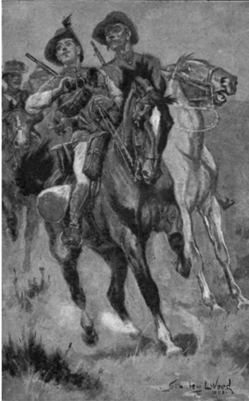
BY CAPT. F. S. BRERETON (See page 11 )