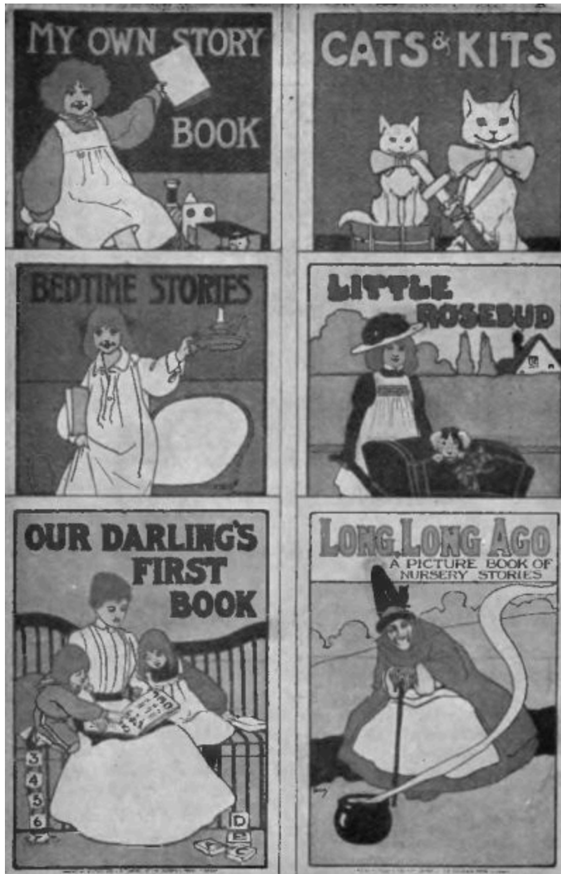
SOME CHILDREN'S PICTURE-BOOKS (See page 32 )