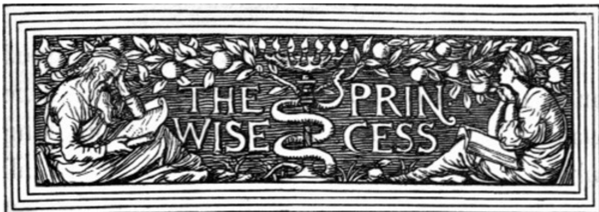
THE WISE PRINCESS