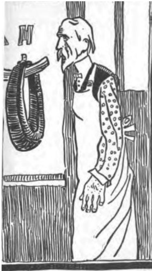
VENERABLE HARNESS DEALER

but you can rest easy that the Pew-Holders were On in a minute. He talked it off in just the Way that Cyrano talks when he gets Roxane so Dizzy that she nearly falls off the Piazza.