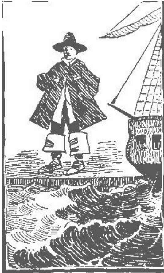
NEW YORK MAN