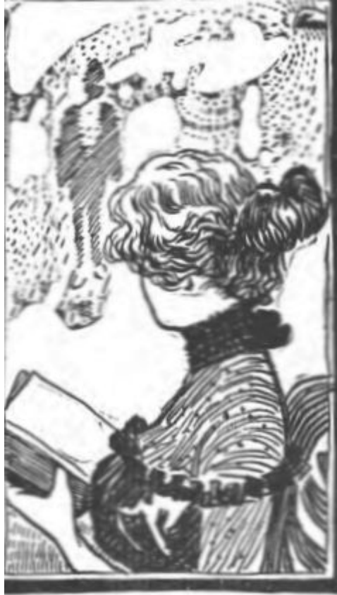
A STRANGE MAN