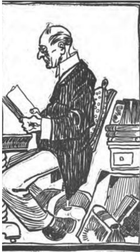
ALL A MOCKERY