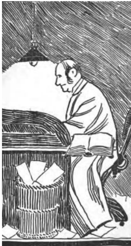
GOOD AND PLENTY

A Stout Woman in the Front Row put on her Eye-Glasses and leaned forward so as not to miss Anything. A Venerable Harness Dealer over at the Right nodded his Head solemnly. He seemed to recognize the Quotation. Members of the Congregation glanced at one another as if to say: "This is certainly Hot Stuff!"