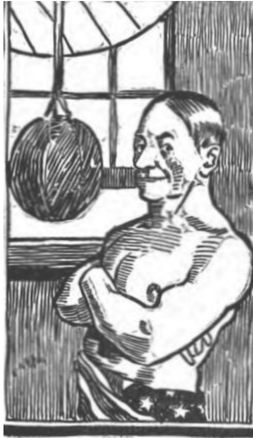
THE COMING CHAMPION