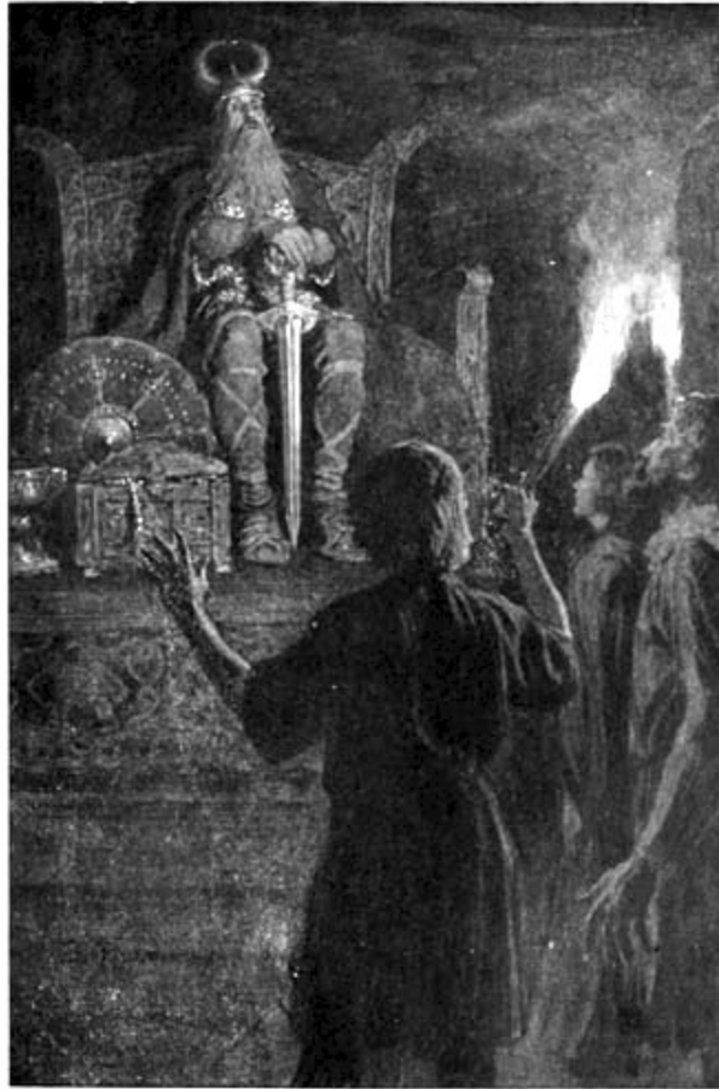
"There he sat as if he were still alive, but there was no sight in his eyes"

"He looks," said Frodi, "as if he would walk."