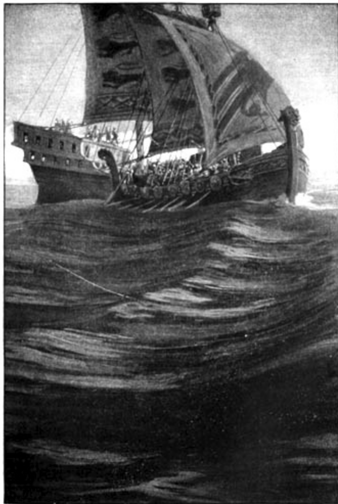
"So tall was she that the vikings could not board her"

"Shame on thee," cried the other, "if thou wilt not fight for the men who harbored thee!"