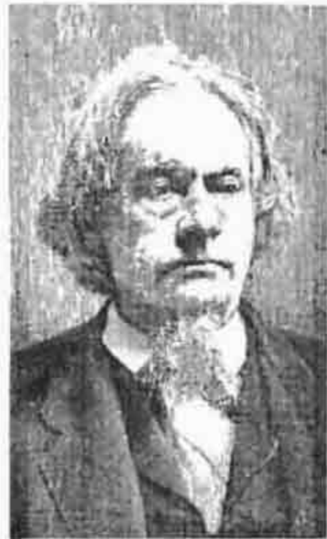
General Robert Toombs

Mr. Iverson, of Georgia, invoking not only secession, but revolution and assassination, announced specifically the hopes of the conspirators. "I am satisfied that South Carolina will resolve herself into a separate sovereign and independent State before the Ides of January; that Florida and Mississippi, whose conventions are soon to meet, will follow the example of South Carolina, and that Alabama ... will go out of the Union on the 7th of January. Then the Georgia Convention follows on the 16th of that month; and if these other surrounding sisters shall take the step, Georgia will not be behind ... I speak what I believe on this floor, that before the 4th of March five of the Southern States at least will have declared their independence; and I am satisfied that three others of the Cotton States