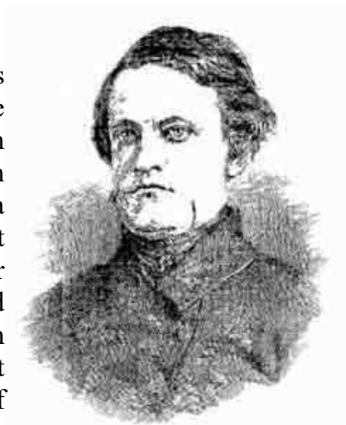
General John C. Breckinridge

A much more hopeful ambition filled his mind. Notwithstanding his recent defeat, he did not think that his personal contest with Douglas was yet finished. He had the faith and the patience to wait six years for a chance to repeat his political tournament with the "Little Giant." From his letter quoted in a previous chapter we know he had resolved to "fight in the ranks" in 1860. From another, we know how generously he kept faith with other Republican aspirants. "If Trumbull and I were candidates for the same office you would have a right to prefer him, and I should not blame you for it; but all my acquaintance with you induces me to believe you would not pretend to be for me while really for him. But I do not understand Trumbull and myself to be rivals. You know I am pledged not to enter a struggle with him for the seat in the Senate now occupied by