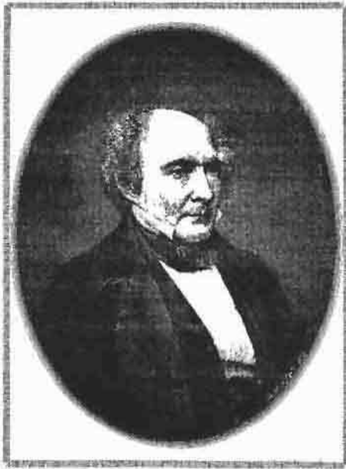
Robert J. Walker

Walker, Topeka Speech, June 6, 1857, in "Washington Union" of June 27, 1857.