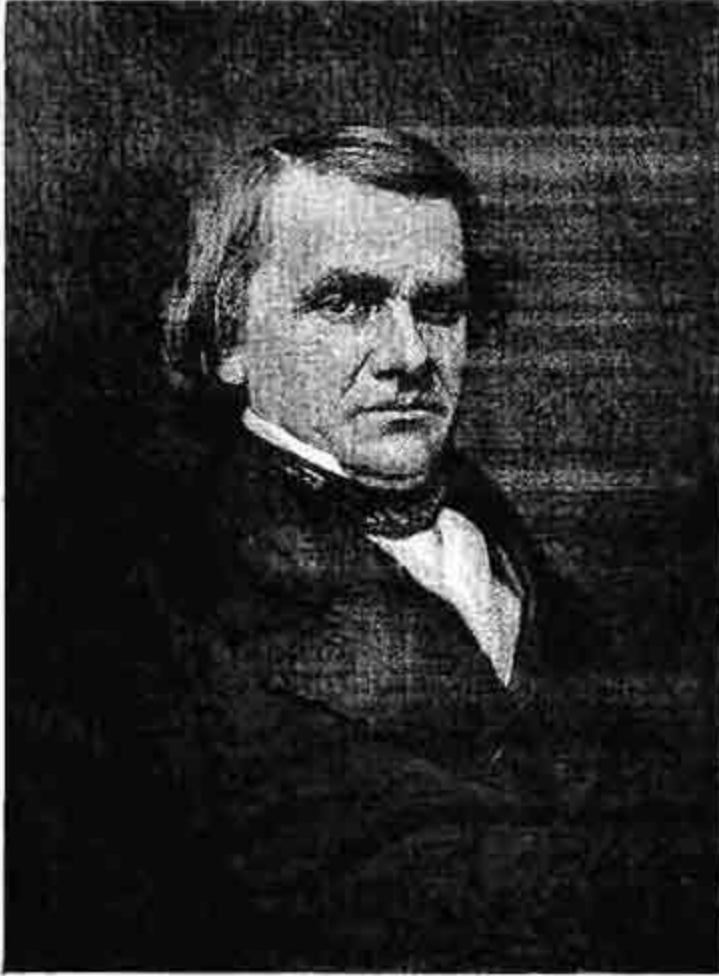
Stephen A. Douglas

that slavery cannot actually exist in the Territories unless the people desire it, and so give it protection by Territorial legislation. If this offends the South, he will let it offend them, as at all events he means to hold on to his chances in Illinois." There is a tradition that on the night preceding this Freeport debate Lincoln was catching a few hours' rest, at a railroad center named Mendota, to which place the converging trains brought after midnight a number of excited Republican leaders, on their way to attend the great meeting at the neighboring town of Freeport. Notwithstanding the late hour, Mr. Lincoln's bedroom