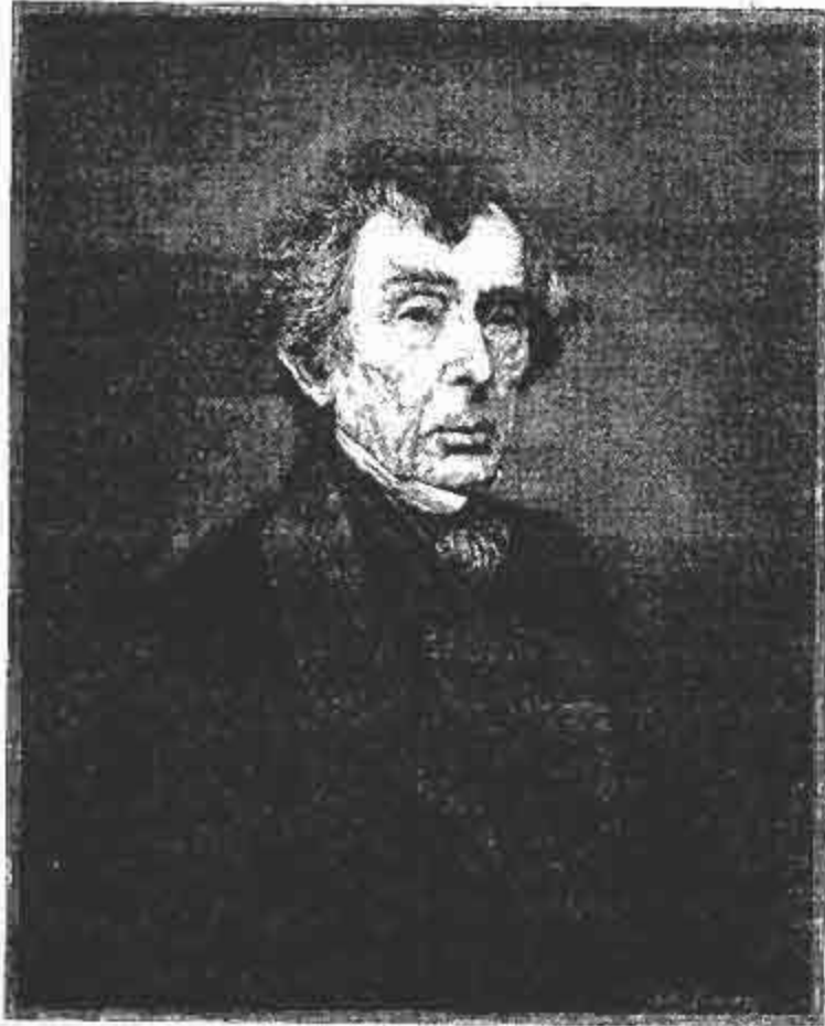
Roger B. Taney

The Presidential election came, and Mr. Buchanan was chosen. Soon after, the court met to begin its long winter term; and about the middle of December, 1856, the Dred Scott case was once more elaborately argued. Again occupying the attention of the court for four successive days, as it had also done in the first hearing, the eminent counsel, after passing lightly over mere technical subtleties, discussed very fully what was acknowledged to be the leading point in the controversy; namely, whether Congress had power under the Constitution to prohibit slavery in the Federal Territories, as it had done by the Missouri Compromise act and various other laws. It was precisely the policy, or impolicy, of this and similar prohibitions which formed the subject of contention in party politics. The question of their constitutional validity was certain to take even a higher rank in public interest.