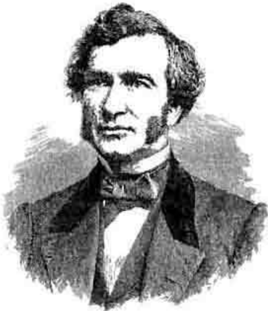
Justin S. Morrill