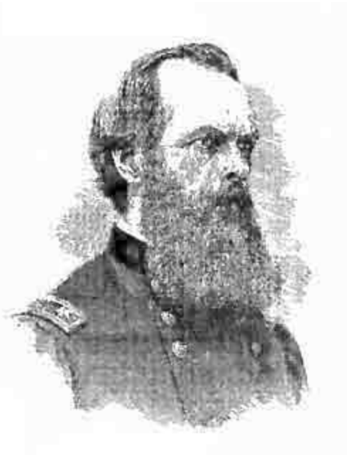
General John W. Geary

The Governor called the chiefs together and made them an earnest harangue. He explained to them his conciliatory policy, read his instructions from Washington, affirmed his determination to keep peace, and appealed personally to Atchison to aid him in enforcing law and preserving order. That wily chief, seeing that refusal would put him in the attitude of a law-breaker, feigned a ready compliance, and he and Reid, his factotum commander, made eloquent speeches "calculated to produce submission to the legal demands made upon them." [14] Some of the lesser captains, however, were mutinous, and treated the Governor to choice bits of Border-Ruffian rhetoric. Law and violence vibrated in uncertain balance, when Colonel Cooke, commanding the Federal troops, took the floor and cut the knot of discussion in a summary way. "I felt called upon to say some words myself," he writes naïvely, "appealing to these militia officers as an old resident of Kansas and friend to the Missourians to submit to the patriotic demand that they should retire, assuring them of my perfect confidence in the inflexible justice of the Governor, and that it would become my painful duty to sustain him at the cannon's mouth." [15] This argument was decisive. The border chiefs felt willing enough to lead their awkward squads against the slight barricades of Lawrence, but quailed at the unlooked-for prospect