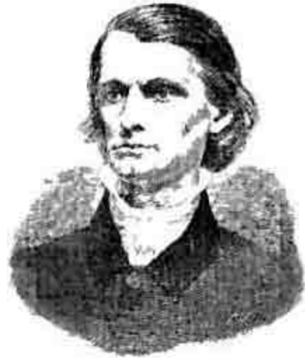
General Henry A. Wise

against fate. This circumstance produced a deplorable result in the South. Under the shadow of impending defeat the Democrats of the Cotton States made the final months of the canvass quite as much a threat against Lincoln as a plea for Breckinridge. This preaching of secession seemed to shallow minds harmless election buncombe; but when the contingency finally arrived, and the choice of Lincoln became a real event, they found themselves already in a measure pledged to resistance. They had vowed they would never submit; and now, with many, the mere pride of consistency moved them to adhere to an ill-considered declaration. The sting of defeat intensified their resentment, and in this irritated frame of mind the secession demagogues among them lured them on skillfully into the rising tide of revolution.