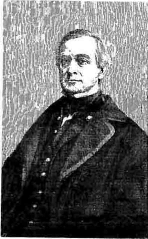
General Robert Anderson

achieved world-wide renown as a great military captain. In the United States, however, the military is subordinated to the civic ambition, and Scott all his life retained a strong leaning to diplomacy and statesmanship, and on several important occasions gave his country valuable service in essentially civic functions. He had been the unsuccessful Presidential candidate of the Whig party in 1852, a circumstance which no doubt greatly increased his personal attention to current politics, then and afterwards. As the first military officer of the nation, he was also the watchful guardian of the public peace.