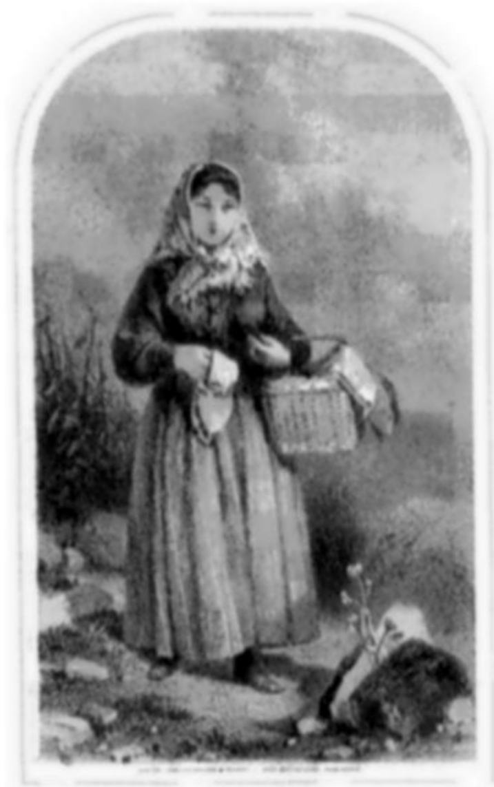
"This, with the antique kirtle and picturesque petticoat is an Acadian portrait." PAGE 56 .