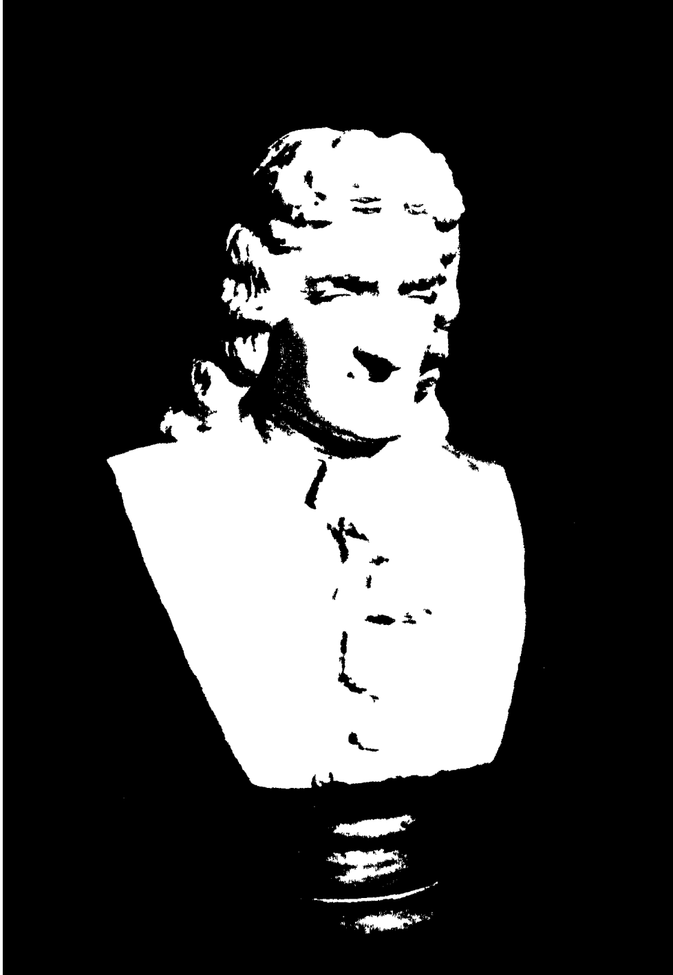
Portrait of Fielding, from bust in the Shire Hall, Taunton.