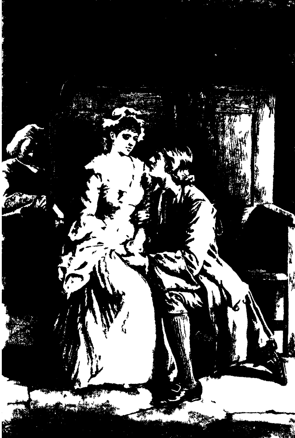
Joseph thanked her on his knees.

Let it suffice then to say, that Fanny, after a thousand entreaties, at last gave up her whole soul to Joseph; and, almost fainting in his arms, with a sigh infinitely softer and sweeter too than any Arabian breeze, she whispered to