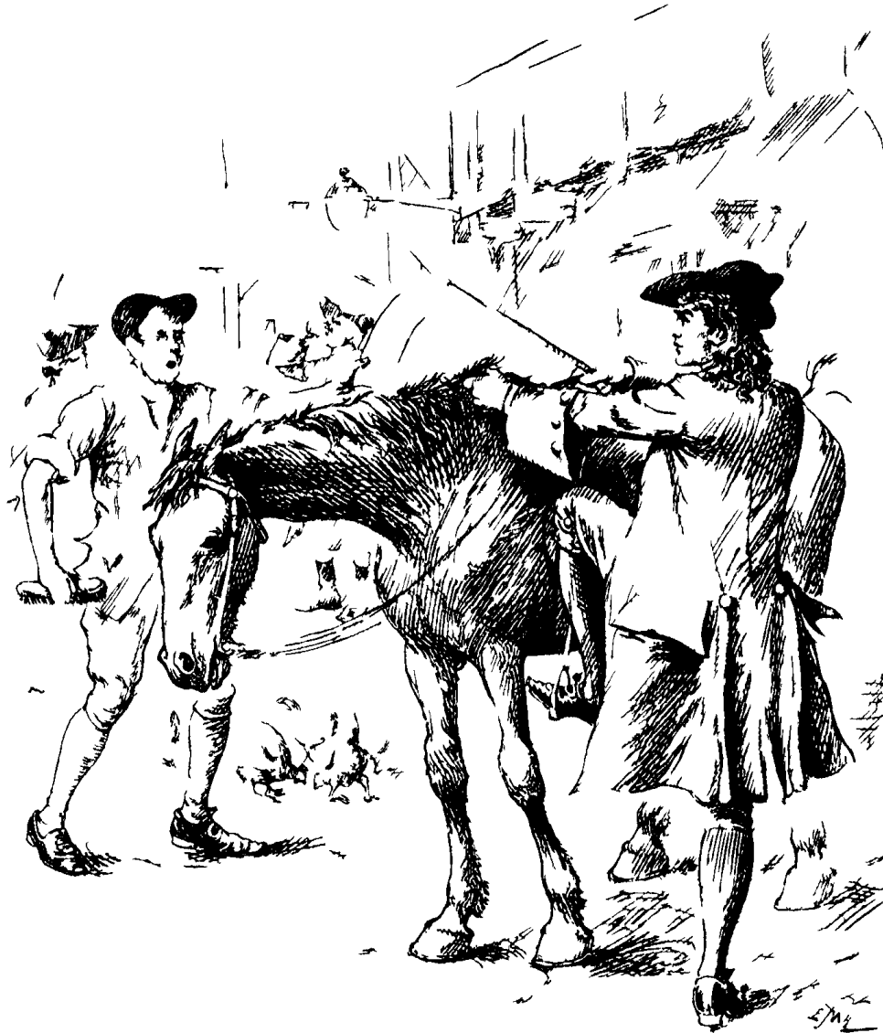
The hostler presented him a bill.

Adams was now gone some minutes, having insisted on Joseph's beginning the journey on horseback, and Joseph had his foot in the stirrup, when the hostler presented him a bill for the horse's board during his residence at the inn. Joseph said Mr Adams had paid all; but this matter, being referred to Mr Tow-ouse, was by him decided in favour of the hostler, and indeed with truth and justice; for this was a fresh instance of that shortness of memory which did not arise from want of parts, but that continual hurry in which parson Adams was always involved.