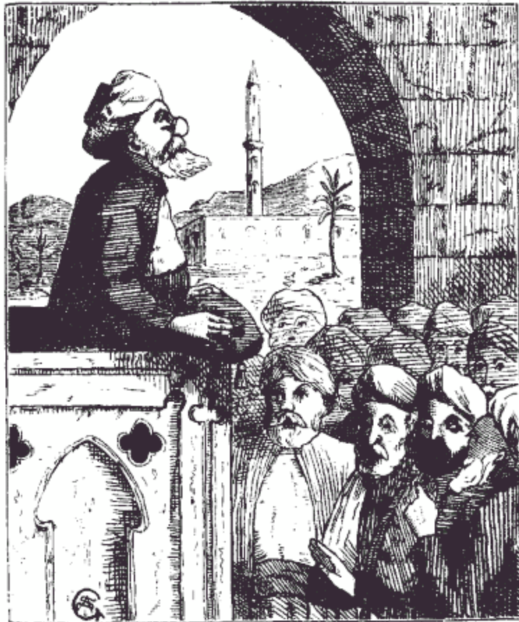
THE KHOJA PREACHES.

The men looked at each other in dismay, for the Khoja was a very popular preacher.