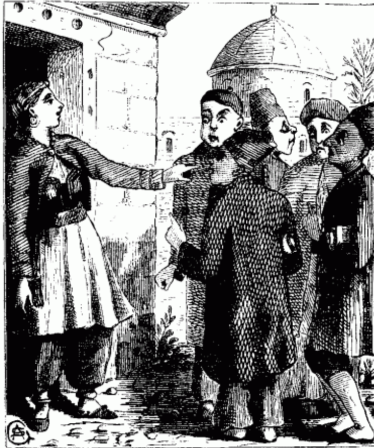
THE KHOJA IS NOT AT HOME.

And so they contradicted each other and bandied words, till the Khoja, who was listening from above, put his head out of the window and cried, "Neither you nor my wife have any sense in your heads. Don't you see there are two doors to the place? If he did come in by one he may have gone out again through the other."