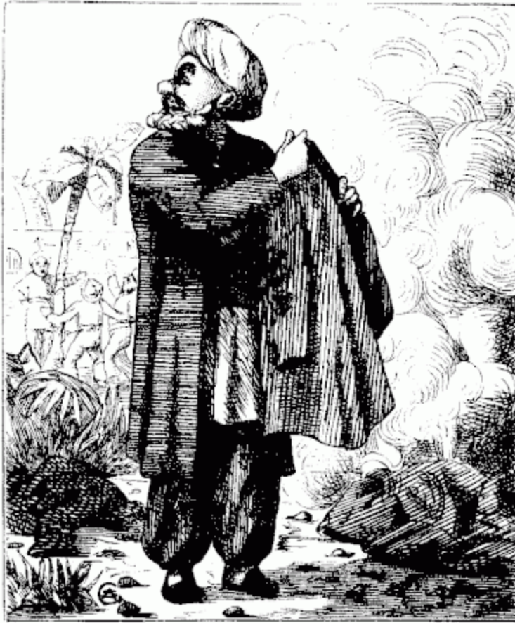
THE KHOJA RECOMPENSES HIS FRIENDS.

Some of his friends were very desirous to get hold of this lamb and make a feast of it. So they came to the Khoja and begged him earnestly to give up the lamb for a feast, but the Khoja would not consent.