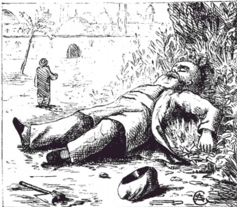
THE KHOJA FALLS.

When he recovered himself he jumped up, and ran after the man who had warned him.