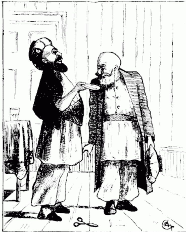
THE KHOJA IS SHAVED.

having paid his penny, took his departure as usual.