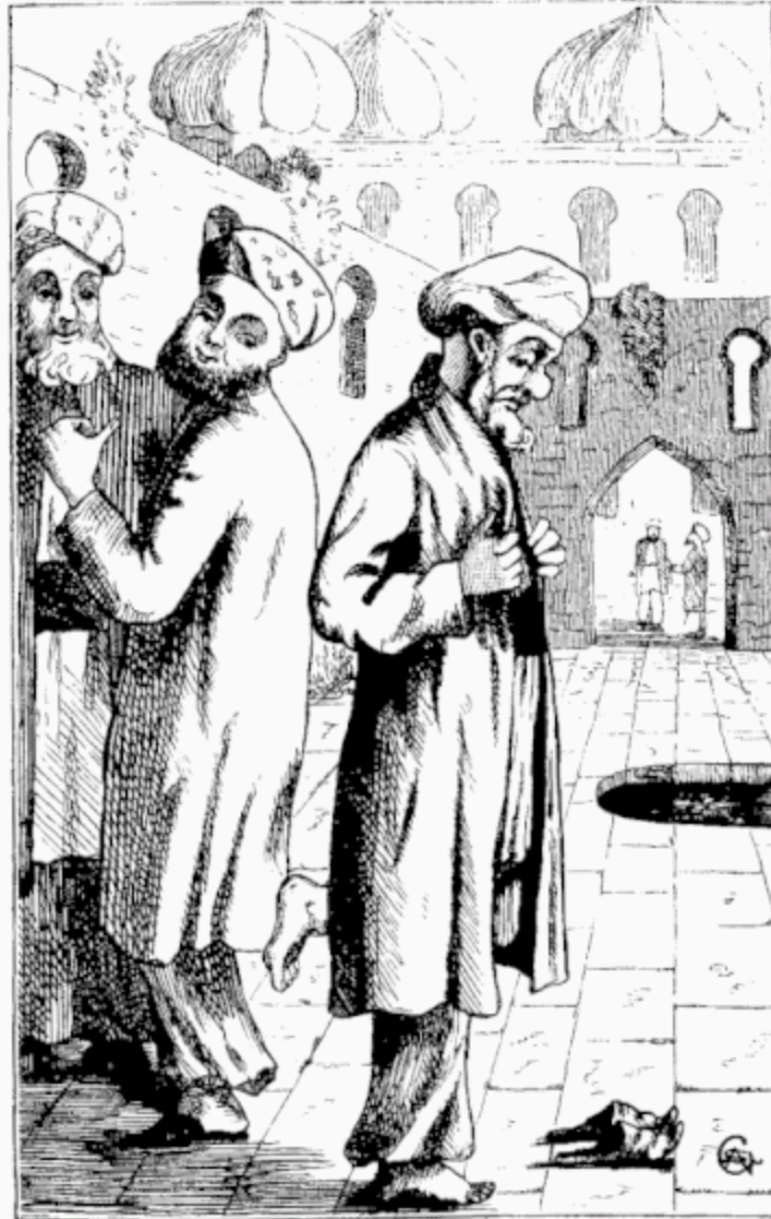
THE KHOJA PRAYS.