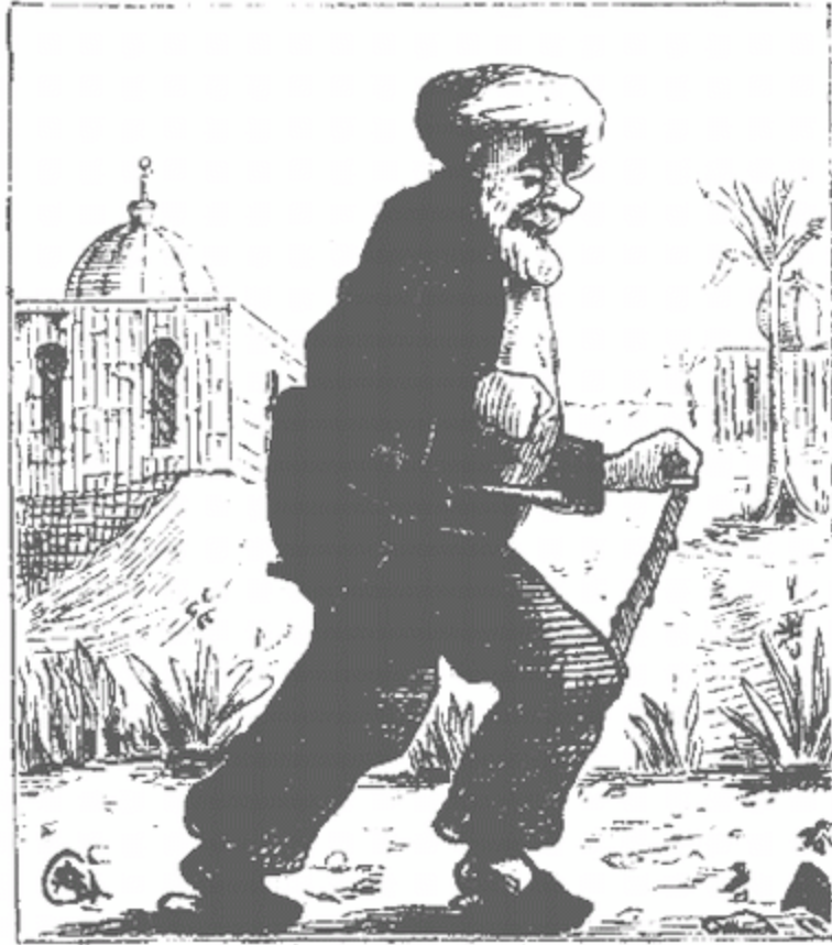
THE KHOJA IS ARTFUL.

When he had done with it he put a smaller pan inside it, and carried it back.