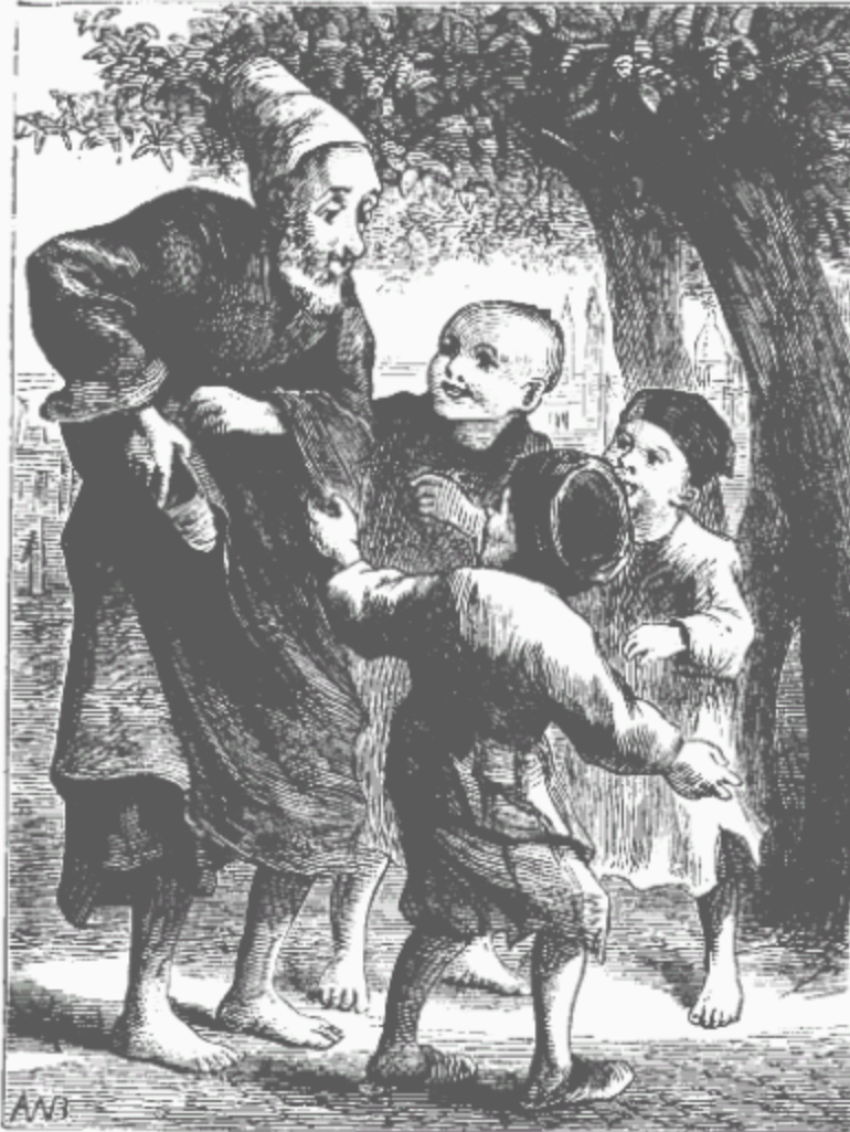
THE KHOJA'S SLIPPERS.

"I will climb it," said the Khoja. Thereupon he kicked off his slippers as the children had anticipated; and tucking his skirts into his girdle, he prepared to climb.