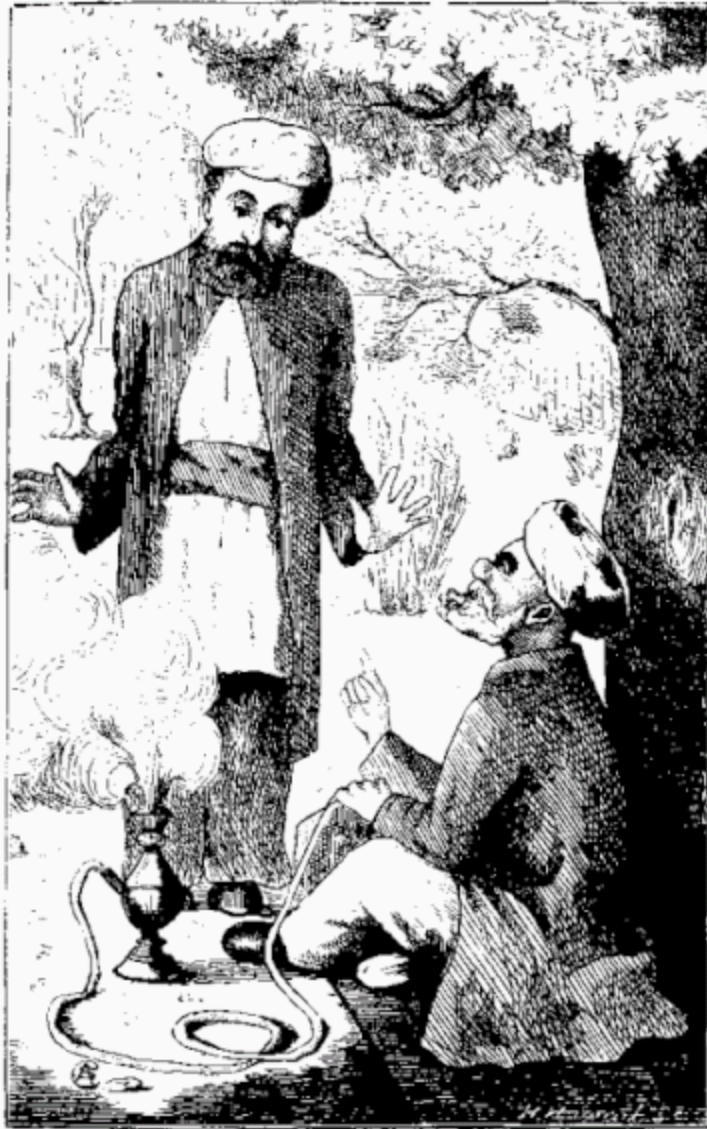
THE KHOJA AND HIS DONKEY.

"Broken knees, sore ribs, aching bones, long marches, and short meals," said the Khoja.