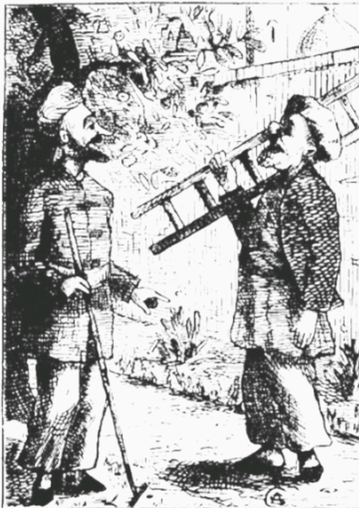
THE KHOJA TRESPASSES.

"Come, come!" said the gardener, "that answer will not do. This is not a place for selling ladders."