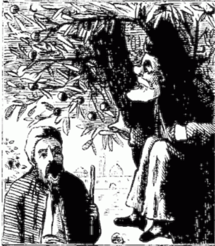
THE KHOJA SINGS.

"It is not the voice of a native songster," said the Khoja demurely, "but the foreign nightingale sings so."