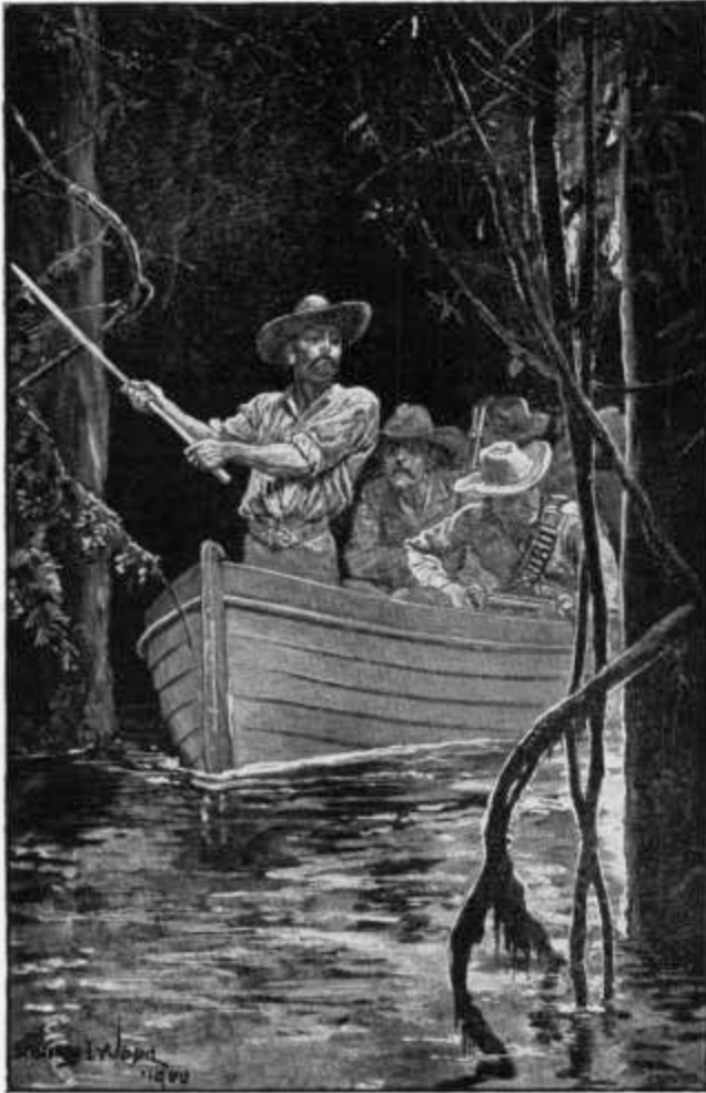
“The man with the boat-hook went on drawing the

“Nothing at all,” replied Briscoe, and then he smiled as he saw the men exchanging glances and