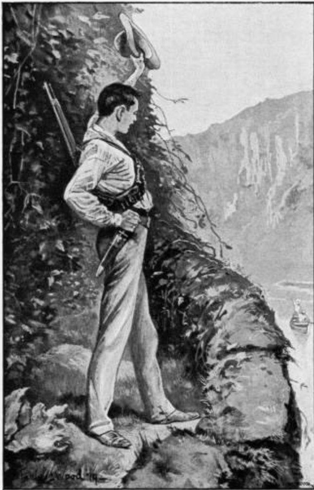
"Brace uttered a loud cheer and stood waving his hat." (P. 381.)

"Hi! Look out there, everyone," shouted Brace. "Lie down."