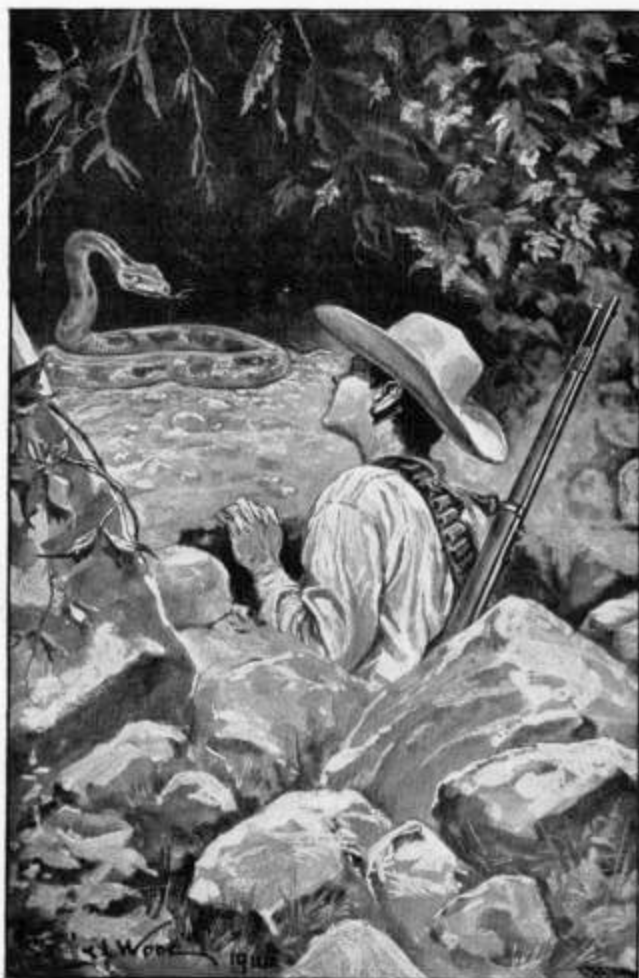
"A serpent raised its head, ready to strike."