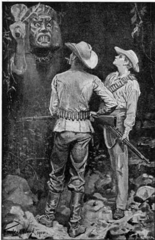
"How are you, old chap?" said Briscoe quietly. (P. 391.)

"That chap's telling a big lie," said Briscoe coolly,