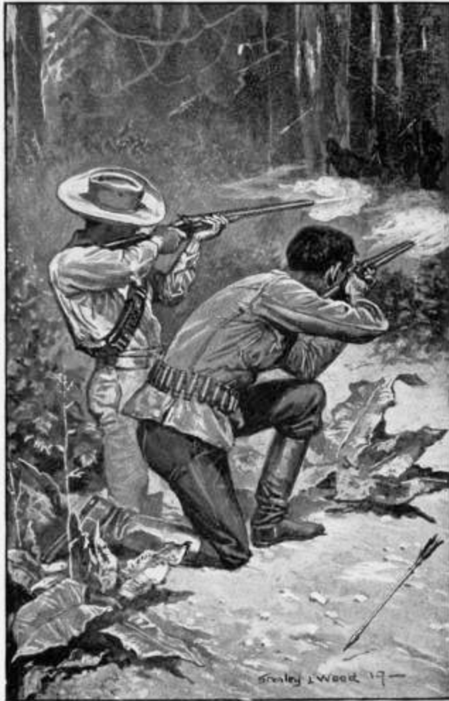
"The guns went off together."

But they had the wrong stuff to deal with, and their eyes dilated and rings of white appeared round the irises in theft utter astonishment at seeing the