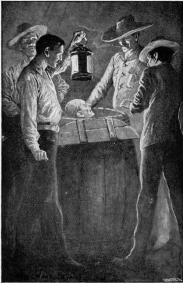
"Well, Dan, how goes it?" said the American. (P. 94.)

The captain turned upon the man fiercely, but it had not the slightest effect upon him, for he kept his cigar in his mouth and smoked away, as he drew out a key like that used for the boot of a coach, thrust it into one of the holes in the head, gave it a turn, and the head of the cask opened outward in two pieces which turned upon hinges; while as the first mate thrust forward the lanthorn he held, it was nearly knocked out of his hand by the skull-cap-covered head which shot up, sending a thrill of relief through the circle of lookers-on.