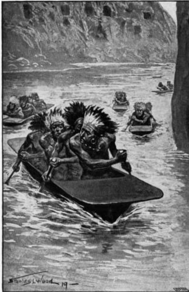
"Every man forced the canoes to their greatest speed." (P. 356.)

Brace had hardly swept the face of the strangely-worked range of cliff when the softly mournful chorus ceased, and as if moved by one impulse, on catching sight of the approaching boats, the Indians burst forth into a shrill piercing yell which echoed and re-echoed discordantly from the face of the rocks. The next moment every man had seized his paddle, and they were making the river foam and sparkle with the vigour of their strokes.