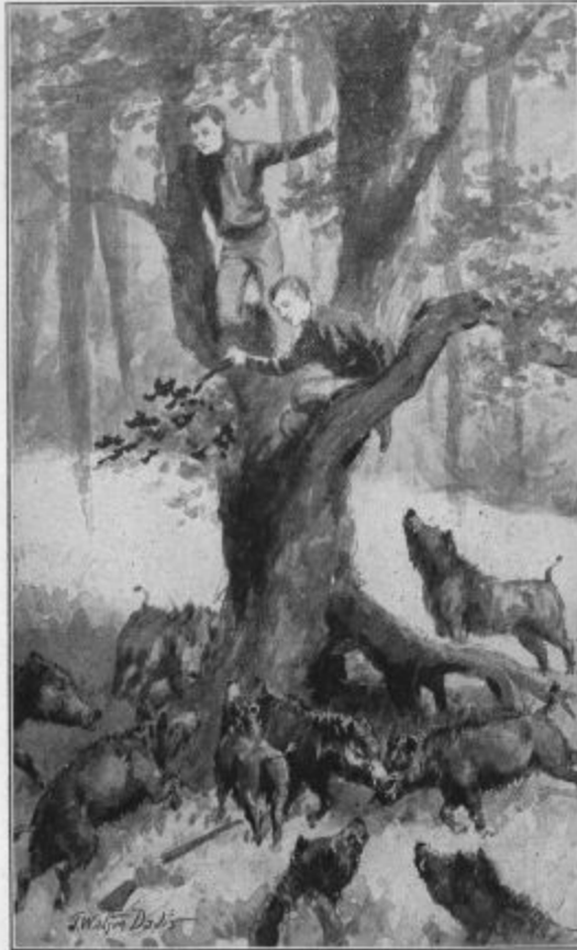
"Now, we are in for it," said Charlie, as he found a seat in the fork of a limb. Page 229.