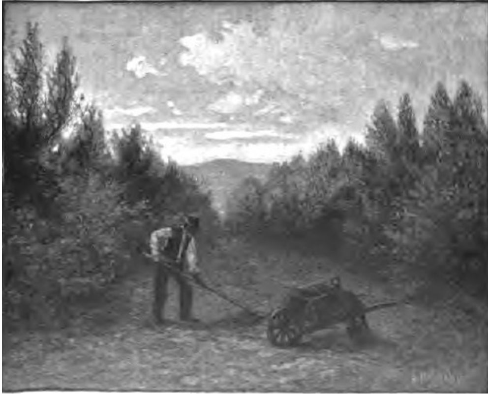
OLIVE-TREES SIX YEARS OLD.

Although Los Angeles County still produces a considerable quantity of wine and brandy, I have an impression that the raising of raisins will supplant wine-making largely in Southern California, and that the principal wine producing will be in the northern portions of the State. It is certain that the best quality is grown in the foot-hills. The reputation of "California wines" has been much injured by placing upon the market crude juice that was in no sense wine. Great improvement has been made in the past three to five years, not only in the vine and knowledge of the soil adapted to it, but in the handling and the curing of the wine. One can now find without much difficulty excellent table wines—sound claret, good white Reisling, and sauterne. None of these wines are exactly like the foreign wines, and it may be some time before the taste accustomed to foreign wines is educated to like them. But in Eastern markets some of the best brands are already much called for, and I think it only a question of time and a little more experience when the best California wines will be popular. I found in the San Francisco market excellent red wines at $3.50 the case, and what was still more remarkable, at some of the best hotels sound, agreeable claret at from fifteen to twenty cents the pint bottle.