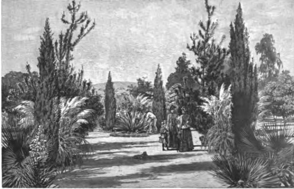
SCENE AT PASADENA.

I have insisted so much upon the Mediterranean character of this region that it is necessary to emphasize the contrasts also. Reserving details and comments on different localities as to the commercial value of products and climatic conditions, I will make some general observations. I am convinced that the fig can not only be grown here in sufficient quantity to supply our markets, but of the best quality. The same may be said of the English walnut. This clean and handsome tree thrives wonderfully in large areas, and has no enemies. The olive culture is in its infancy, but I have never tasted better oil than that produced at Santa Barbara and on San Diego Bay. Specimens of the pickled olive are delicious, and when the best varieties are generally grown, and the best method of curing is adopted, it will be in great demand, not as a mere relish, but as food. The raisin is produced in all the valleys of Southern California, and in great quantities in the hot valley of San Joaquin, beyond the Sierra Madre range. The best Malaga raisins, which have the reputation of being the best in the world, may never come to our market, but I have never eaten a better raisin for size, flavor, and thinness of skin than those raised in the El Cajon Valley, which is watered by the great flume which taps a reservoir in the Cuyamaca Mountains, and supplies San Diego. But the quality of the raisin in California will be improved by experience in cultivation and handling.