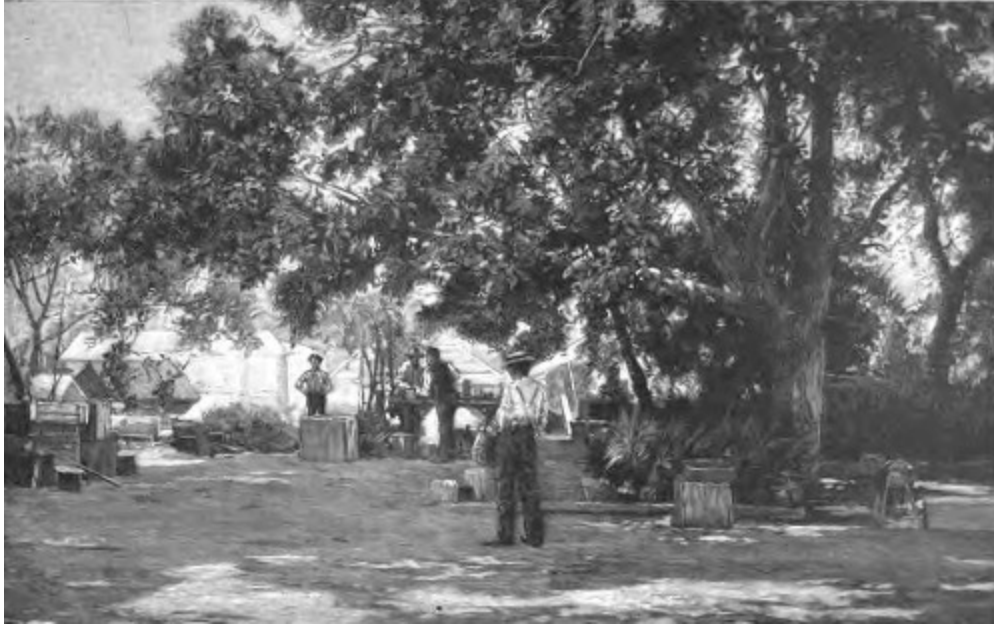
PACKING CHERRIES, POMONA.

Pasadena, which exhibits everywhere evidences of wealth and culture, and claims a permanent population of 12,000, has the air of a winter resort; the great Hotel Raymond is closed in May, the boarding-houses want occupants, the shops and livery-stables customers, and the streets lack movement. This is easily explained. It is not because Pasadena is not an agreeable summer residence, but because the visitors are drawn there in the winter principally to escape the inclement climate of the North and East, and because special efforts have been made for their entertainment in the winter. We found the atmosphere delightful in the middle of May. The mean summer heat is 67^{\circ} , and the nights are always cool. The hills near by may be resorted to with the certainty of finding as decided a change as one desires in the summer season. I must repeat that the Southern California summer is not at all understood in the East. The statement of the general equability of the temperature the year through must be insisted on. We lunched one day in a typical California house, in the midst of a garden of fruits, flowers, and tropical shrubs; in a house that might be described as half roses and half tent, for added to the wooden structure were rooms of canvas, which are used as sleeping apartments winter and summer.