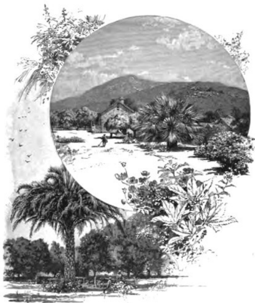
SCENES IN MONTECITO AND LOS ANGELES.

and that neither forest nor fruit trees would grow without irrigation. Between Los Angeles and Redondo Beach is a ranch of 35,000 acres. Seventeen years ago it was owned by a Scotchman, who used the whole of it as a sheep ranch. In selling it to the present owner he warned him not to waste time by attempting to farm it; he himself raised no fruit or vegetables, planted no trees, and bought all his corn, wheat, and barley. The purchaser, however, began to experiment. He planted trees and set out orchards which grew, and in a couple of years he wrote to the former owner that he had 8000 acres in fine wheat. To say it in a word, there is scarcely an acre of the tract which is not highly productive in barley, wheat, corn, potatoes, while considerable parts of it are especially adapted to the English walnut and to the citrus fruits.