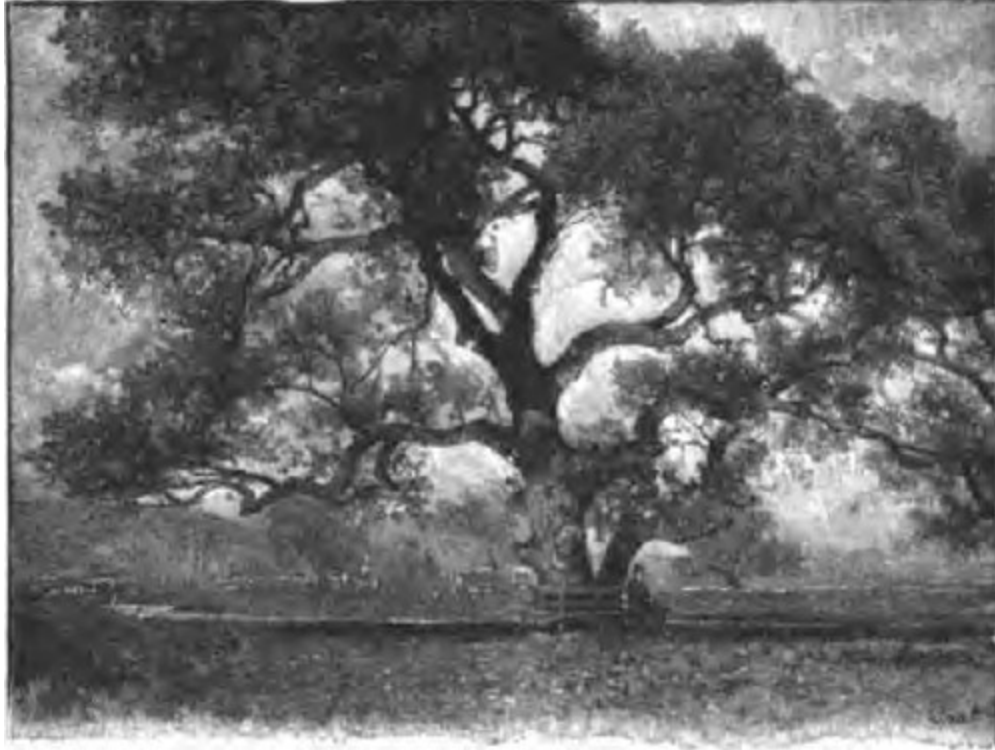
LIVE-OAK NEAR LOS ANGELES.