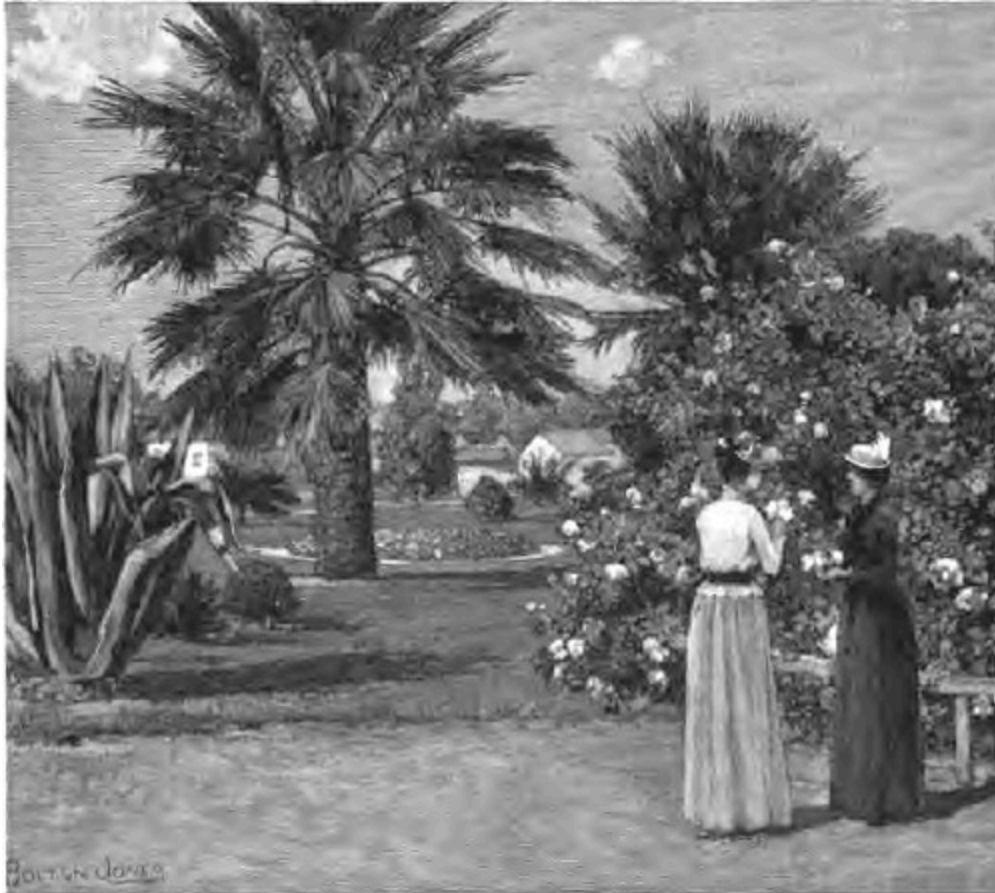
GARDEN SCENE, SANTA ANA.

be one of daily discontent, the change from a landscape clad with verdure, the riotous and irrepressible growth of a rainy region, to a land that the greater part of the year is green only where it is artificially watered, where all the hills and unwatered plains are brown and sere, where the foliage is coated with dust, and where driving anywhere outside the sprinkled avenues of a town is to be enveloped in a cloud of powdered earth. This discomfort must be weighed against the commercial advantages of a land of irrigation.