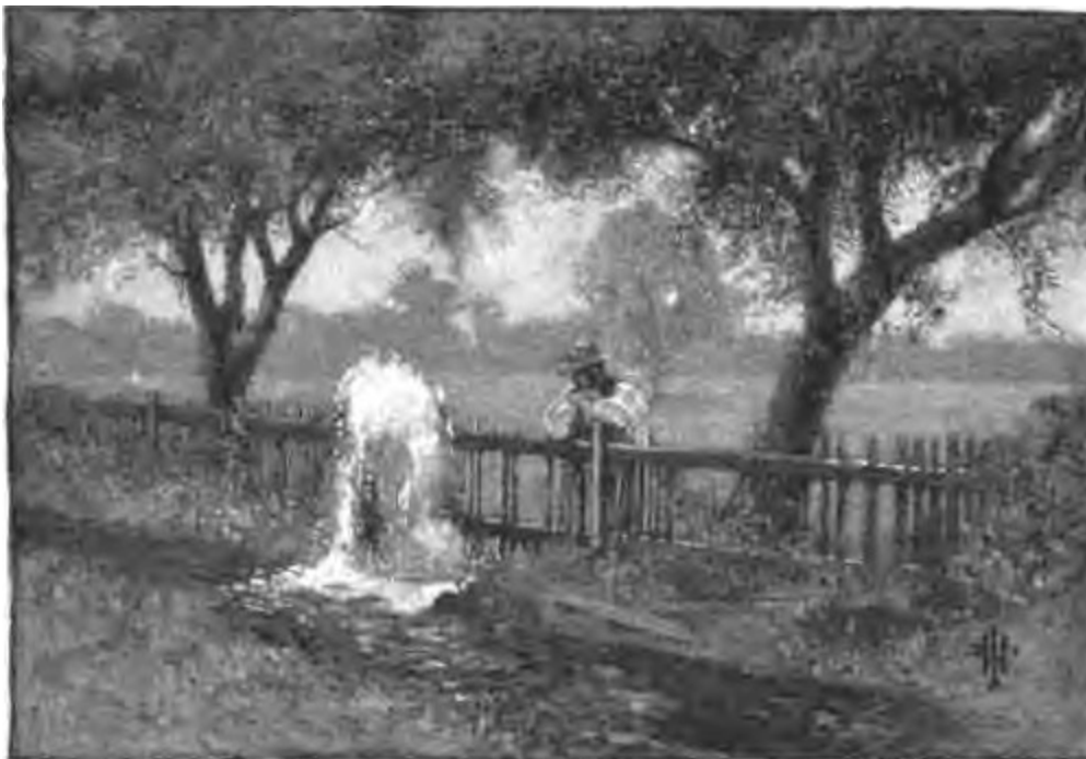
IRRIGATION BY ARTESIAN-WELL SYSTEM.

As to the quantity of water needed in the kind of soil most common in Southern California I will again quote Mr. Van Dyke: "They will tell you at Riverside that they use an inch of water to five acres, and some say an inch to three acres. But this is because they charge to the land all the waste on the main ditch, and because they use thirty per cent. of the water in July and August, when it is the lowest. But this is no test of the duty of water; the amount actually delivered on the land should be taken. What they actually use for ten acres at Riverside, Redlands, etc., is a twenty-inch stream of three days' run five times a year, equal to 300 inches for one day, or one inch steady run for 300 days. As an inch is the equivalent of 365 inches for one day, or one inch for 365 days, 300 inches for one day equals an inch to twelve acres. Many use even less than this, running the water only two or two and a half days at a time. Others use more head; but it rarely exceeds 24 inches for three days and five times a year, which would be 72 multiplied by 5, or 360 inches—a little less than a full inch for a year for ten acres."