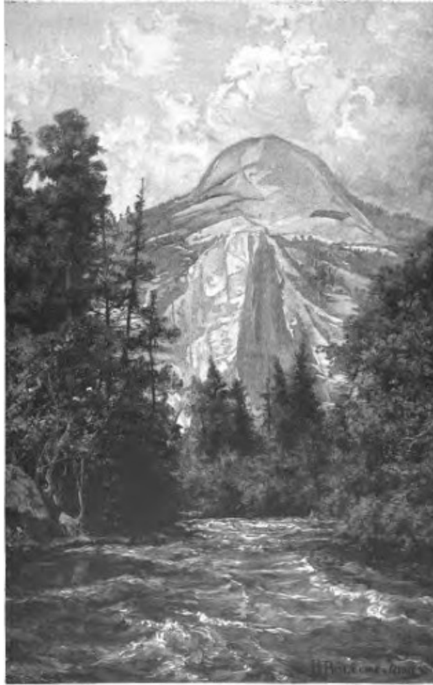
THE YOSEMITE DOME.

The railway will do no more injury to the Yosemite than it has done to Niagara, and, in fact, will be the means of immensely increasing the comfort of the visitor's stay there, besides enabling tens of thousands of people to see it who cannot stand the fatigue of the stage ride over the present road. The Yosemite will remain as it is. The simplicity of its grand features is unassailable so long as the Government protects the forests that surround it and the streams that pour into it. The visitor who goes there by rail will find plenty of adventure for days and weeks in following the mountain trails, ascending to the great points of view, exploring the cañons, or climbing so as to command the vast stretch of the snowy Sierras. Or, if he is not inclined to adventure, the valley itself will satisfy his highest imaginative flights of the sublime in rock masses and perpendicular ledges, and his sense of beauty in the graceful water-falls, rainbow colors, and