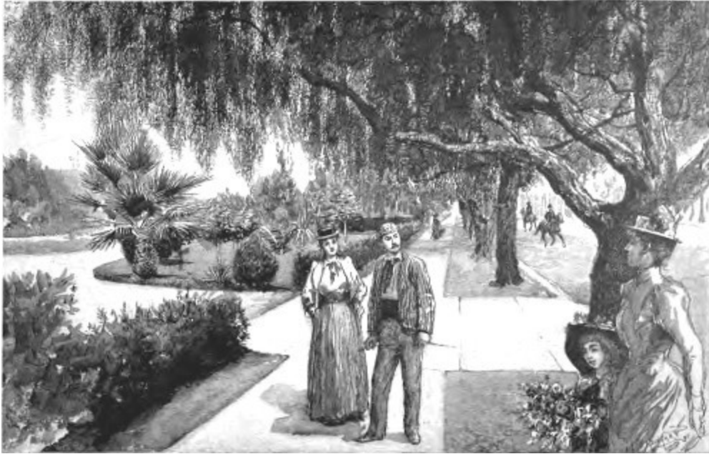
AVENUE LOS ANGELES.

Another misapprehension this visit is correcting. I was told not to visit Southern California at this season on account of the heat. But I have no experience of a more delightful summer climate than this, especially on or near the coast.