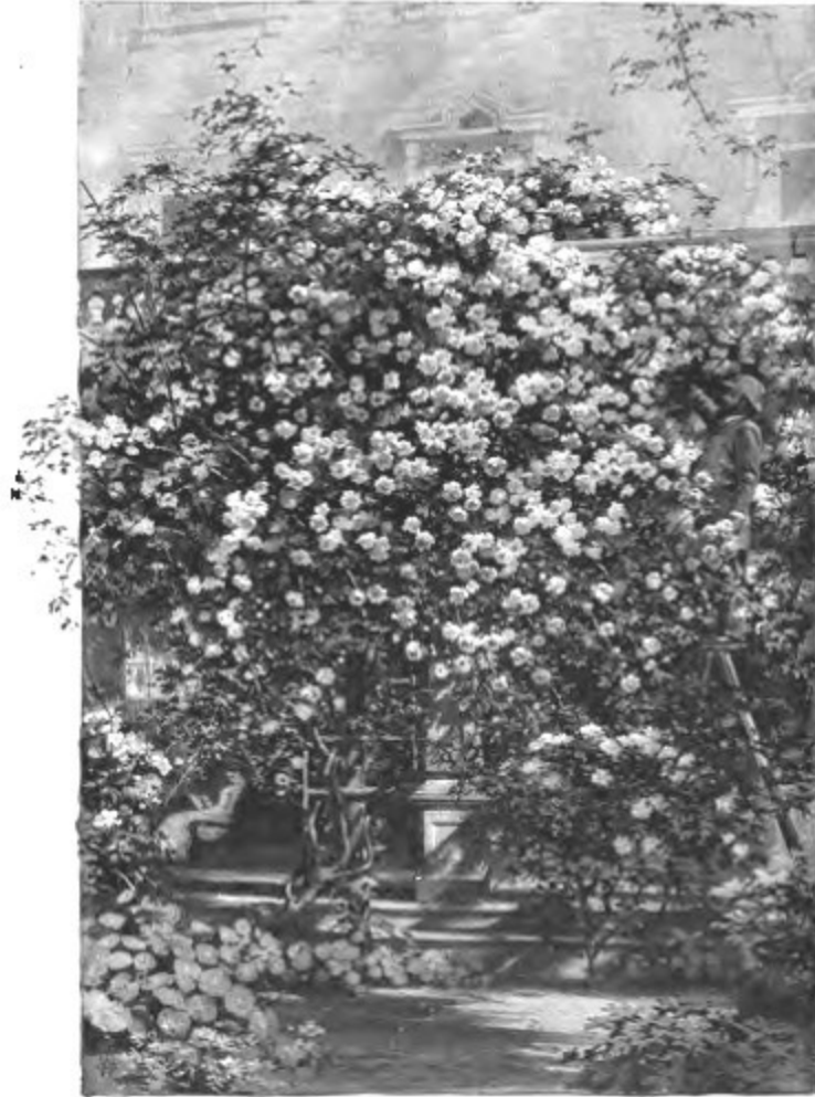
ROSE-BUSH, SANTA BARBARA.

To those who prefer the immediate ocean air to that air as modified by such valleys as the San Gabriel and the Santa Ana, the coast offers a variety of choice in different combinations of sea and mountain climate all along the southern sunny exposure from Santa Barbara to San Diego. In Santa Barbara County the Santa Inez range of mountains runs westward to meet the Pacific at Point Conception. South of this noble range are a number of little valleys opening to the sea, and in one of these, with a harbor and sloping upland and cañon of its own, lies Santa Barbara, looking southward towards the sunny islands of Santa Rosa and Santa Cruz. Above it is the Mission Cañon, at the entrance of which is the best-preserved of the old Franciscan missions. There is a superb drive eastward along the long and curving sea-beach of four miles to the cañon of Monticito, which is rather a series of nooks and terraces, of lovely places and gardens, of plantations of