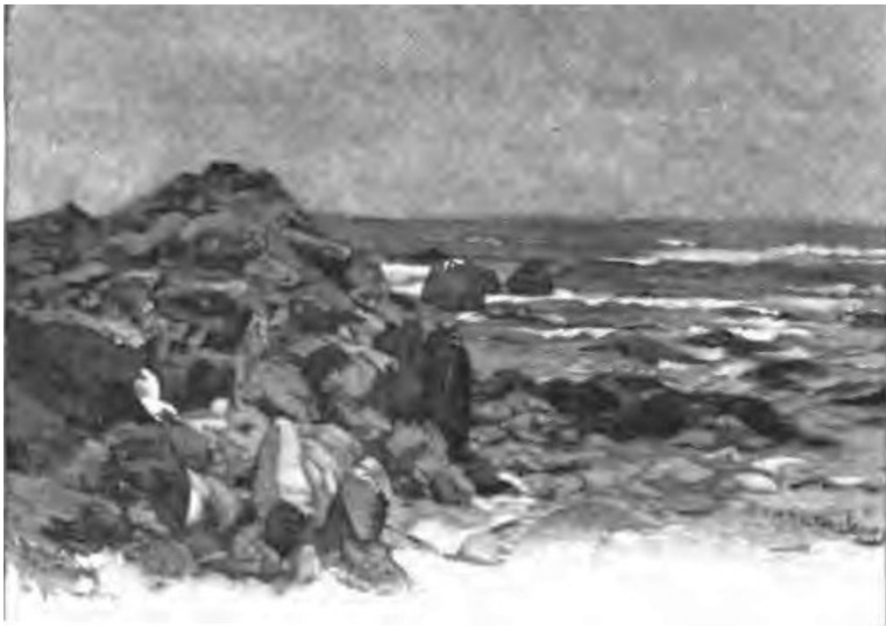
NEAR SEAL ROCK.

This is as true of the Mariposa big tree region as of the valley. Indeed, more care is needed for the trees than for the great chasm, for man cannot permanently injure the distinctive features of the latter, while the destruction of the sequoias will be an irreparable loss to the State and to the world. The Sequoia gigantea differs in leaf, and size and shape of cone, from the great Sequoia semper virens on the coast near Santa Cruz; neither can be spared. The Mariposa trees, scattered along on a mountain ridge