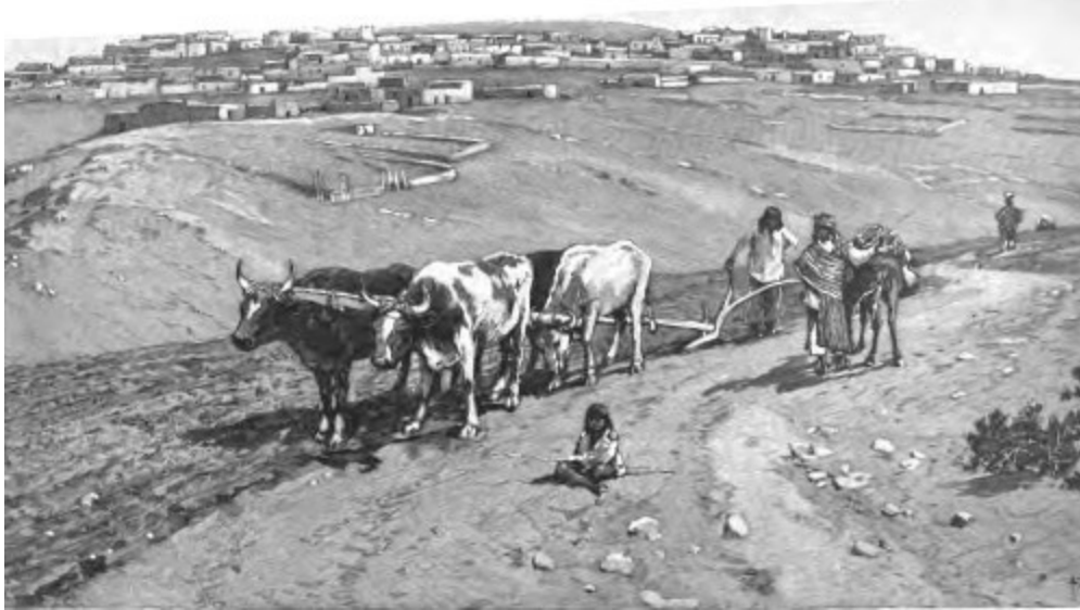
LAGUNA, FROM THE SOUTH-EAST.