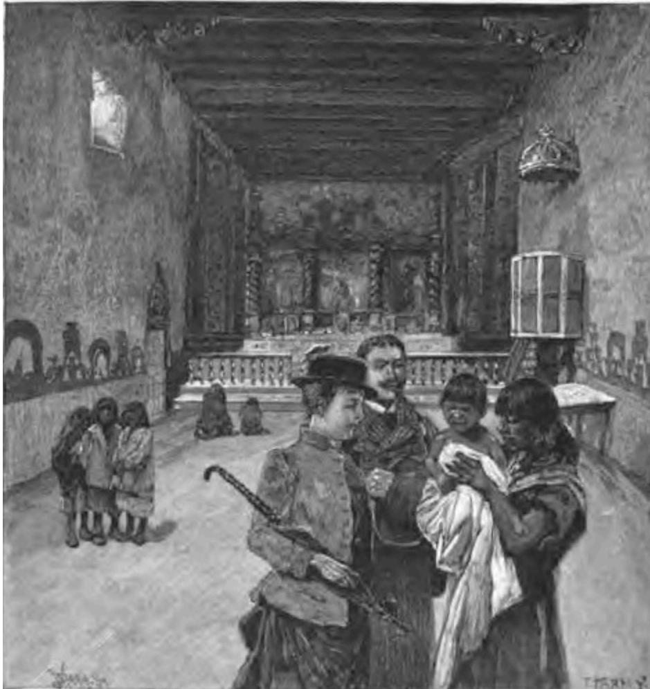
INTERIOR OF THE CHURCH AT LAGUNA.

horizon, color and infinite beauty of outline, and a warm soil with unlimited possibilities when moistened. All that these deserts need is water. A fatal want? No. That is simply saying that science can do for this region what it cannot do for the high wilderness of frost—by the transportation of water transform it into gardens of bloom and fields of fruitfulness. The wilderness shall be made to feed the desert.