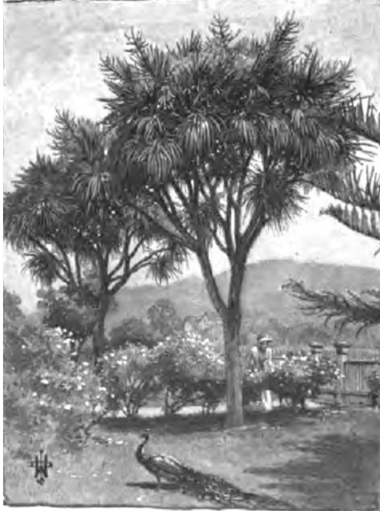
YUCCA-PALM, SANTA BARBARA.

If the reader will look upon the map of California he will see that the eight counties that form Southern California—San Luis Obispo, Santa Barbara, Ventura, Kern, Los Angeles, San Bernardino, Orange, and San Diego—appear very mountainous. He will also notice that the eastern slopes of San Bernardino and San Diego are deserts. But this is an immense area. San Diego County alone is as large as Massachusetts, Connecticut, and Rhode Island combined, and the amount of arable land in the valleys, on the foothills, on the rolling mesas, is enormous, and capable of sustaining a dense population, for its fertility and its yield to the acre under cultivation are incomparable. The reader will also notice another thing. With the railroads now built and certain to be built through all this diversified region, round from the Santa Barbara Mountains to the San Bernardino, the San Jacinto, and down to Cuyamaca, a ride of an hour or two hours brings one to some