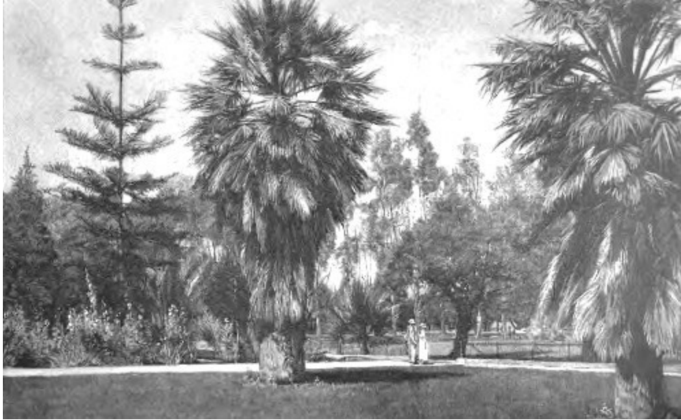
A TYPICAL GARDEN, NEAR SANTA ANA.