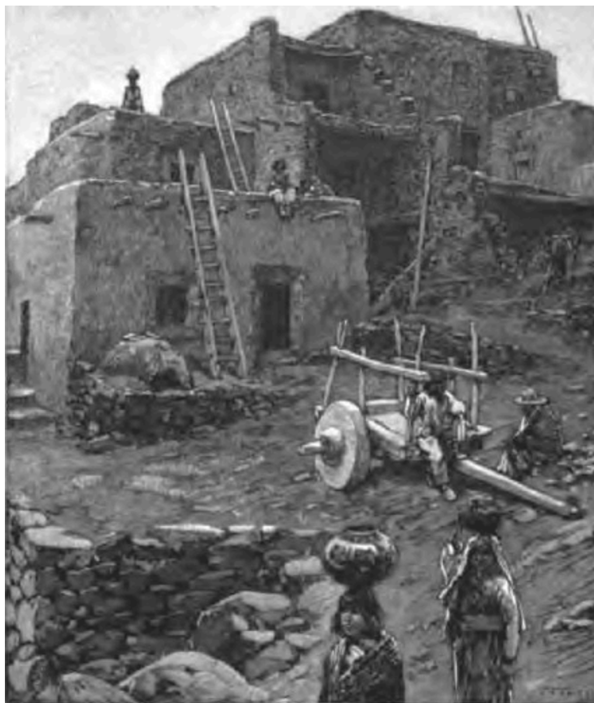
TERRACED HOUSES, PUEBLO OF LAGUNA.

work in their fields. Notwithstanding the houses are only sun-dried bricks, and the village is without water or street commissioners, I was struck by the universal cleanliness. There was no refuse in the corners or alleys, no odors, and many of the rooms were patterns of neatness. To be sure, an old woman here and there kept her hens in an adjoining apartment above her own, and there was the litter of children and of rather careless house-keeping. But, taken altogether, the town is an example for some more civilized, whose inhabitants wash oftener and dress better than these Indians.