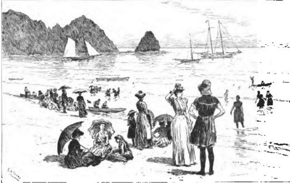
AT AVALON, SANTA CATALINA ISLAND.

If one desires a thoroughly insular climate, he may cross to the picturesque island of Santa Catalina. All along the coast flowers bloom in the winter months, and the ornamental semi-tropical plants thrive; and there are many striking headlands and pretty bays and gentle seaward slopes which are already occupied by villages, and attract visitors who would practise economy. The hills frequently come close to the shore, forming those valleys in which the Californians of the pastoral period placed their ranch houses. At San Juan Capistrano the fathers had one of their most flourishing missions, the ruins of which are the most picturesque the traveller will find. It is altogether a genial, attractive coast, and if the tourist does not prefer an inland situation, like the Hotel Raymond (which scarcely has a rival anywhere in its lovely surroundings), he will keep on down the coast to San Diego.