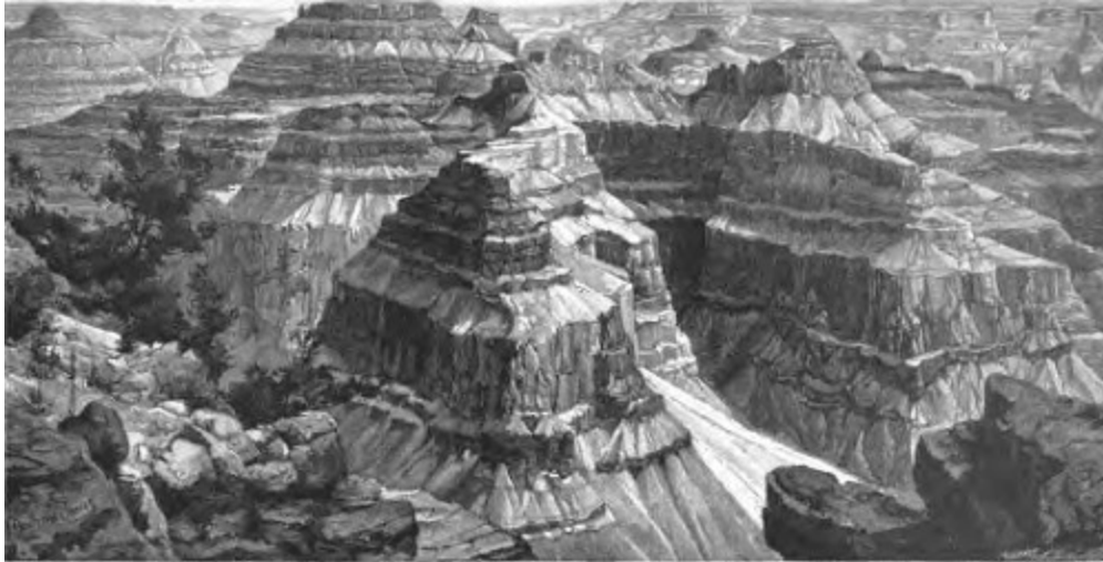
GRAND CAÑON ON THE COLORADO—VIEW FROM POINT SUBLIME.

The chancel walls are covered with frescos, and there are several quaint paintings, some of them not very bad in color and drawing. The altar, which is supported at the sides by twisted wooden pillars, carved with a knife, is hung with ancient sheepskins brightly painted. Back of the altar are some archaic wooden images, colored; and over the altar, on the ceiling, are the stars of heaven, and the sun and the moon, each with a face in it. The interior was scrupulously clean and sweet and restful to one coming in from the glare of the sun on the desert. It was evidently little used, and the Indians who accompanied us seemed under no strong impression of its sanctity; but we liked to linger in it, it was so bizarre , so picturesque, and exhibited in its rude decoration so much taste. Two or three small birds flitting about seemed to enjoy the coolness and the subdued light, and were undisturbed by our presence.