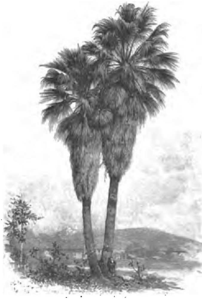
FAN-PALM, FERNANDO ST. LOS ANGELES.

free sweep of winds or the absence of disease germs, or what else it may be ascribed to, one thing is certain, that there is no pneumonia, bronchitis, or pleurisy lying in wait for either the infant or the aged."