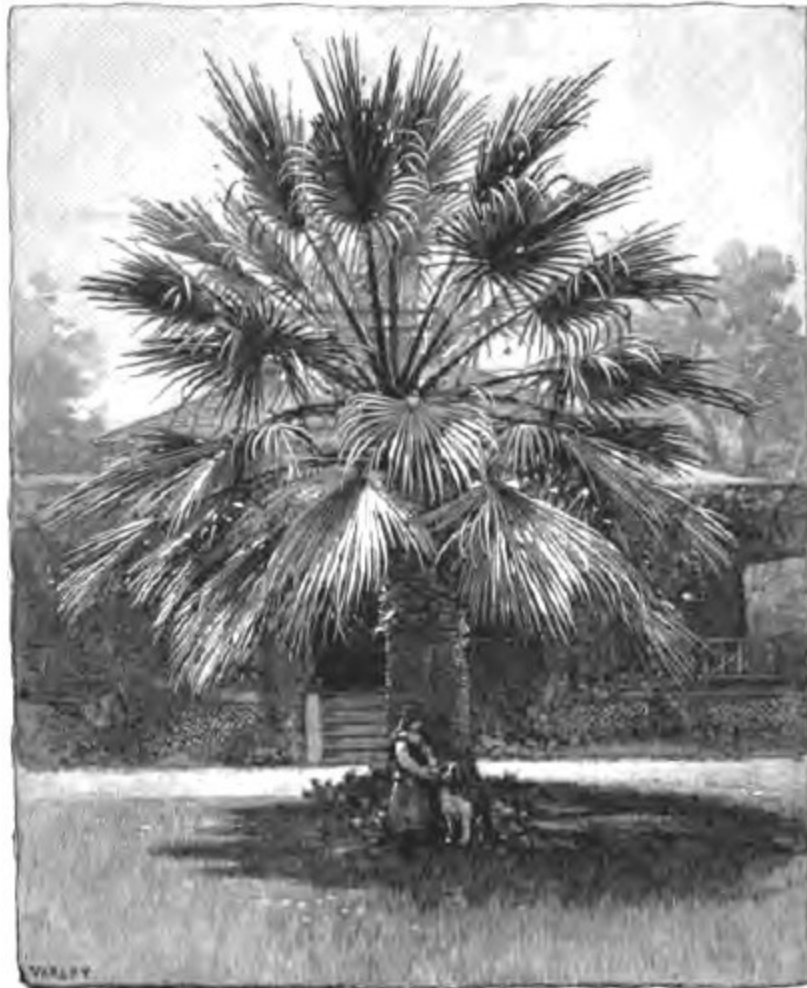
FAN-PALM, LOS ANGELES.

progress here will be seen before long in almost every part of this wonderful land, for conditions of soil and climate are essentially everywhere the same, and capital is finding out how to store in and bring from the fastnesses of the mountains rivers of clear water taken at such elevations that the whole arable surface can be irrigated. The development of the country has only just begun.