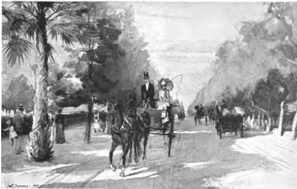
MAGNOLIA AVENUE, RIVERSIDE.

it, either in fruits, vegetables, or grain, is demonstrated to be beyond the experience of farming elsewhere.