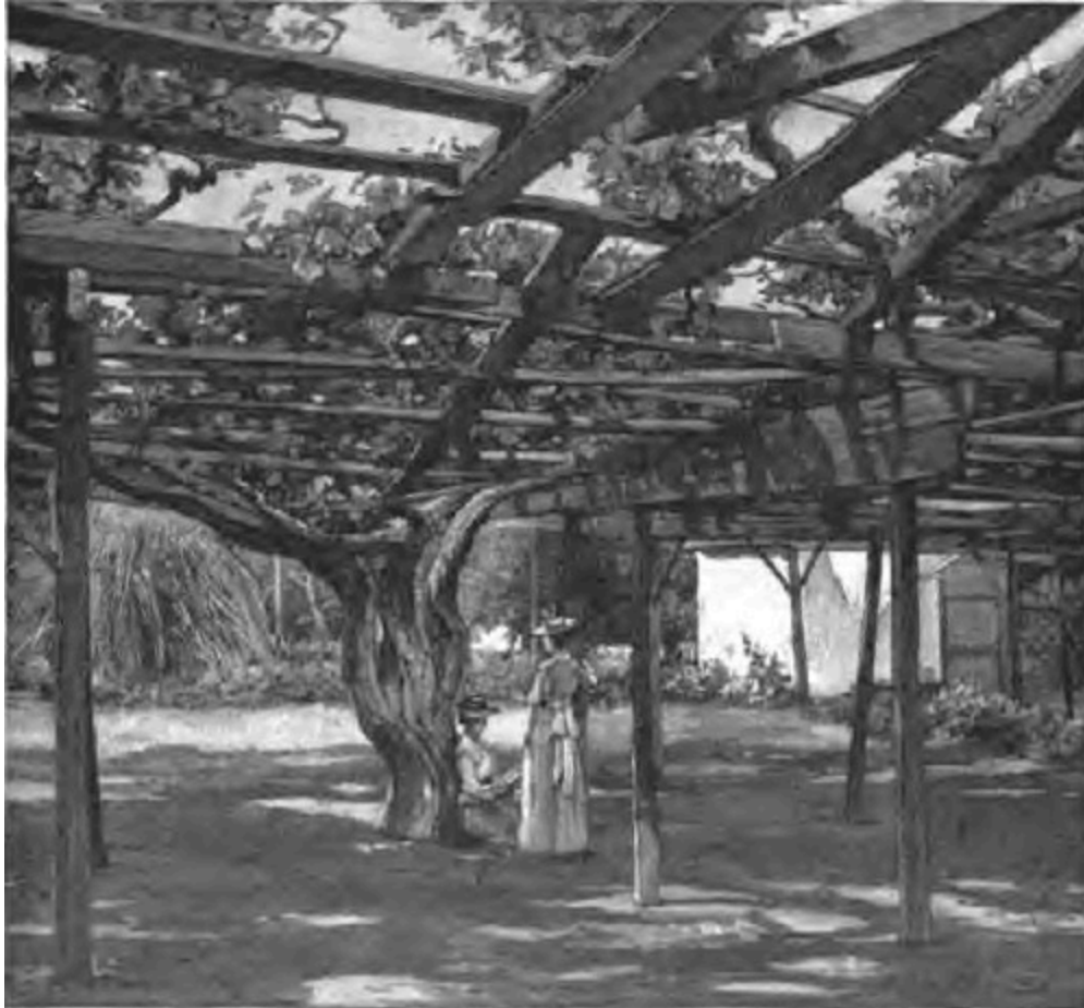
A GRAPE-VINE, MONTECITO VALLEY, SANTA BARBARA.

San Bernardino is comparatively an old town. It was settled in 1853 by a colony of Mormons from Salt Lake. The remains of this colony, less than a hundred, still live here, and have a church like the other sects, but they call themselves Josephites, and do not practise polygamy. There is probably not a sect or schism in the United States that has not its representative in California. Until 1865 San Bernardino was merely a straggling settlement, and a point of distribution for Arizona. The discovery that a large part of the county was adapted to the orange and the vine, and the advent of the Santa Fé railway, changed all that. Land that then might have been bought for $4 an acre is now sold at from $200 to $300, and the city has become the busy commercial centre of a large number of growing villages, and of one of the most remarkable orange and vine districts in the world. It has many fine buildings, a population of about 6000, and a decided air of vigorous business. The great plain about it is mainly devoted to agricultural products,