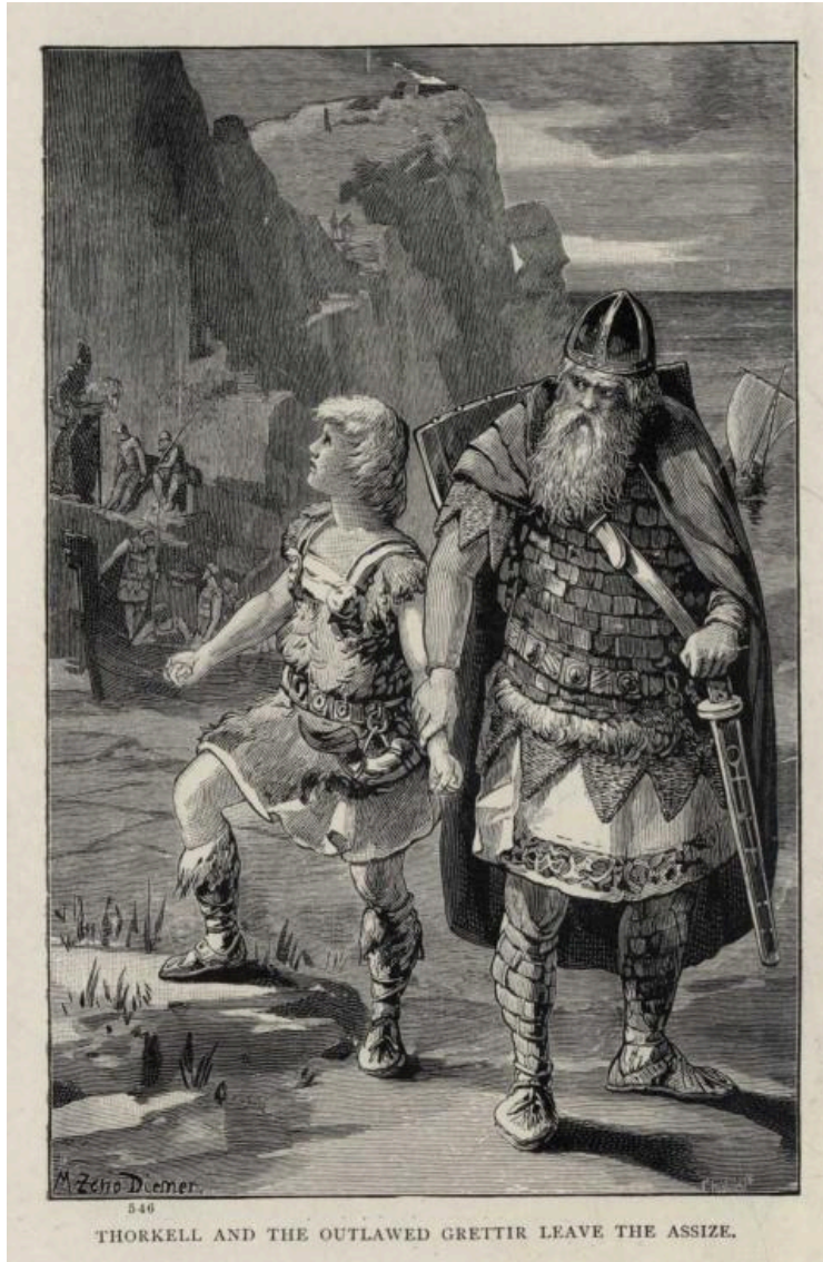
THORKELL AND THE OUTLAWED GRETTIR LEAVE THE ASSIZE.