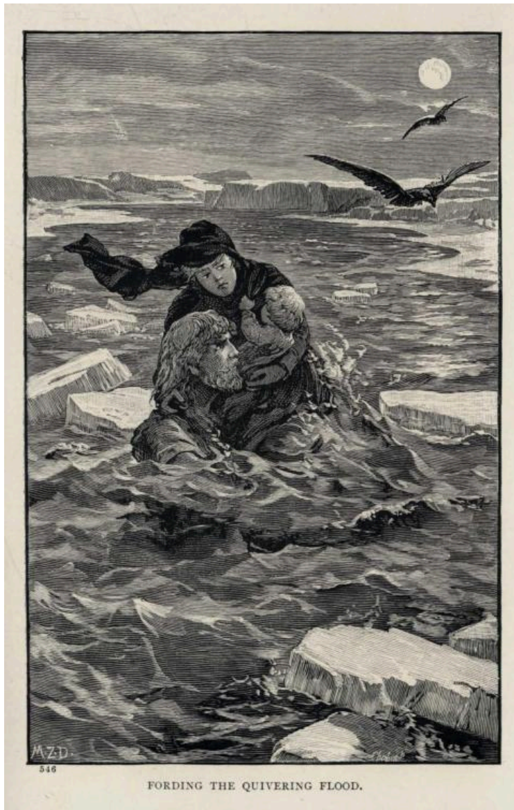
FORDING THE QUIVERING FLOOD.

"I don't care about making two journeys when one will suffice," answered Grettir. "Come, jump up; I will carry you in my arms."