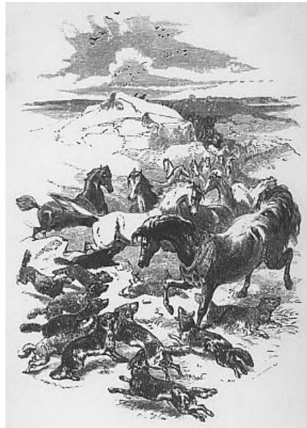
WILD HORSES AND WOLVES.—Page 330.

dashed to pieces more than once, but for her steadiness and forbearance. At last, we were obliged to part with her; that is, we were going to live where we could not keep her; and a friend took her into his park, where she was to remain free all the rest of her life. Five years after, I was sitting at an open window, in the neighbourhood of the metropolis, and a sound met my ear. "If ever I heard Peggy's step," I exclaimed, "that is it; she is now coming along the road." I was disbelieved; but in one minute after, the still beautiful creature, though thirty-three years old, was at the gate: we rushed to her; we called her; she answered us; she danced about; she rubbed her face against ours; she looked for the same caresses, the same niceties which she used to get from us—and half an hour quickly passed in mutual caresses. The gentleman in whose park she had been living, had found her so fresh, that he had ridden her by easy journeys, to London, and during his few days' visit, sent her to see us—she lived two years after that, and died of old age, without a struggle.