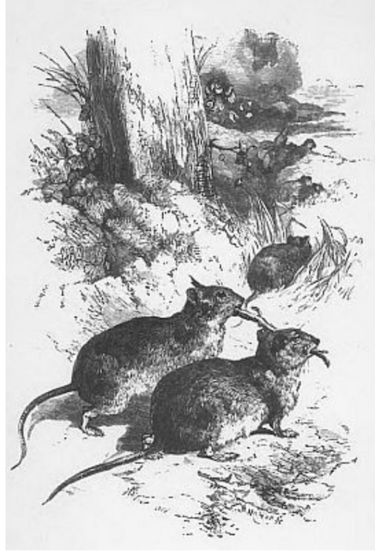
LEADING THE BLIND RAT.—Page 261.

One afternoon, the commandant of Bathurst was quietly reading, when he heard a violent squeaking and hissing in the room below him, which was even with the ground, and contained stores. He took the key, and followed by his servants armed with sticks, went to ascertain the cause. On opening the door they beheld a rat and a venomous serpent engaged in mortal combat. Nothing could be more beautiful than the action of both animals; the rat had retreated for a moment, and stood with flashing eyes; the head of the serpent was reared to receive a fresh attack; again and again they closed and separated, but the reptile, although much bitten, gained the victory; the rat fell, foamed at the mouth, swelled to a great size, and died in a very few minutes. The serpent glided away, but was afterwards discovered in her nest with several young ones, in a crack of the store-room wall, close to a staircase, which we were in the habit of descending daily, and where, in fact, I had often seen the serpents' heads peeping out, and had waited till they were withdrawn.