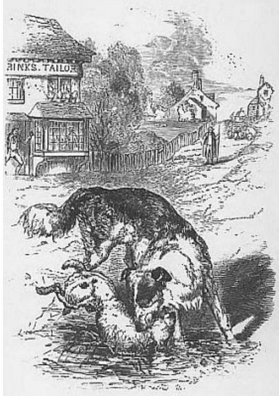
THE SHEPHERD'S DOG AND CUR.—Page 102.