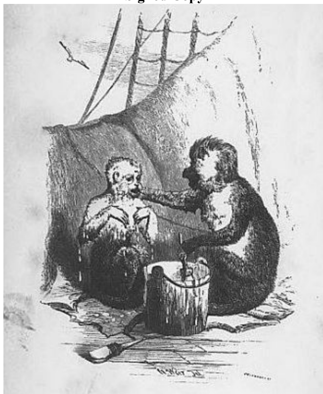
The Monkey Painter—Page 7.