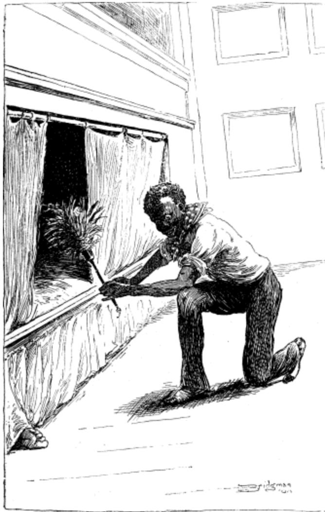
DAVE FINDS MULGRUM UNDER THE BERTH.

The table was hurriedly cleared by the steward, and the captain paid a visit to his state room, during which he did not fail to look under his berth. He had a trunk there, and he saw that it had been moved to the front of the space, so that there was room enough for the conspirator to conceal his body behind it, though his was a good-sized body. Returning to the cabin, he took his usual seat at the table, facing the door. In a few minutes more Mr. Flint and Mr. Baskirk came to the door and were invited to come in. Dave had returned from the galley, and he was instructed to watch that door as he was told to close it.