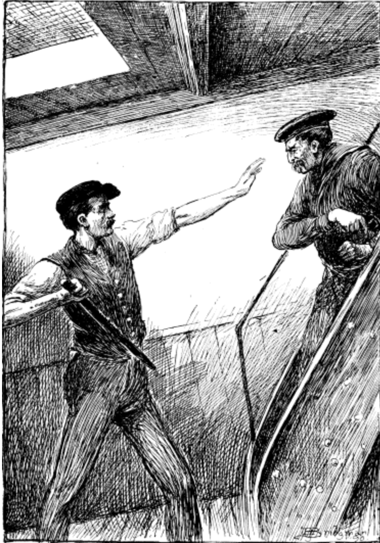
MULGRUM AND THE ENGINEER (Page 75)