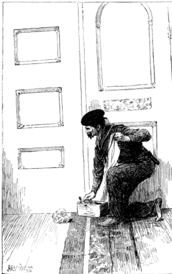
MULGRUM AT THE CAPTAIN'S DOOR.

"That is Pink Mulgrum, Captain Passford," said he, evidently to prevent his superior from misinterpreting the lightness of his conduct. "As you are aware, he is deaf and dumb."