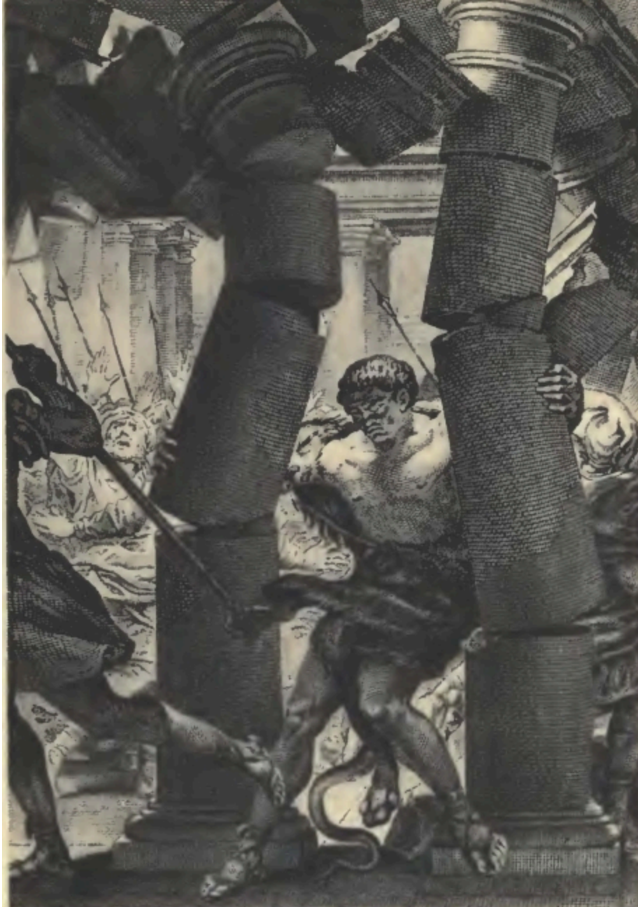
Samson destroying the Temple.