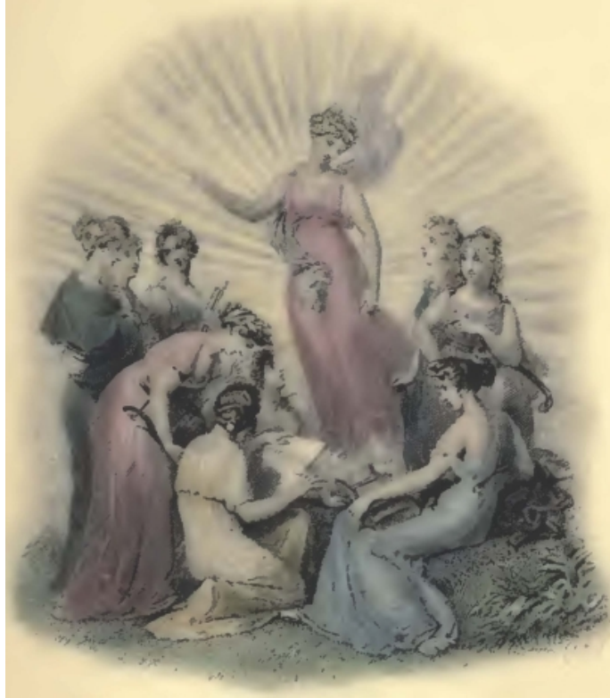
Genius inspiring the muses.

"Here," said the spirit, "are twelve millions of Americans slain in their own country for not having been baptized." "Ah! My God! why were not these frightful skeletons left to whiten in the hemisphere where the bodies were born, and where they were murdered in so many various ways? Why are all these abominable monuments of barbarity and fanaticism assembled here?" "For thy instruction."