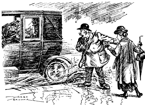
Grieved Wife. "OH, SIMON, ALL OVER YOUR NOO CONTROLLED TROUSERS."