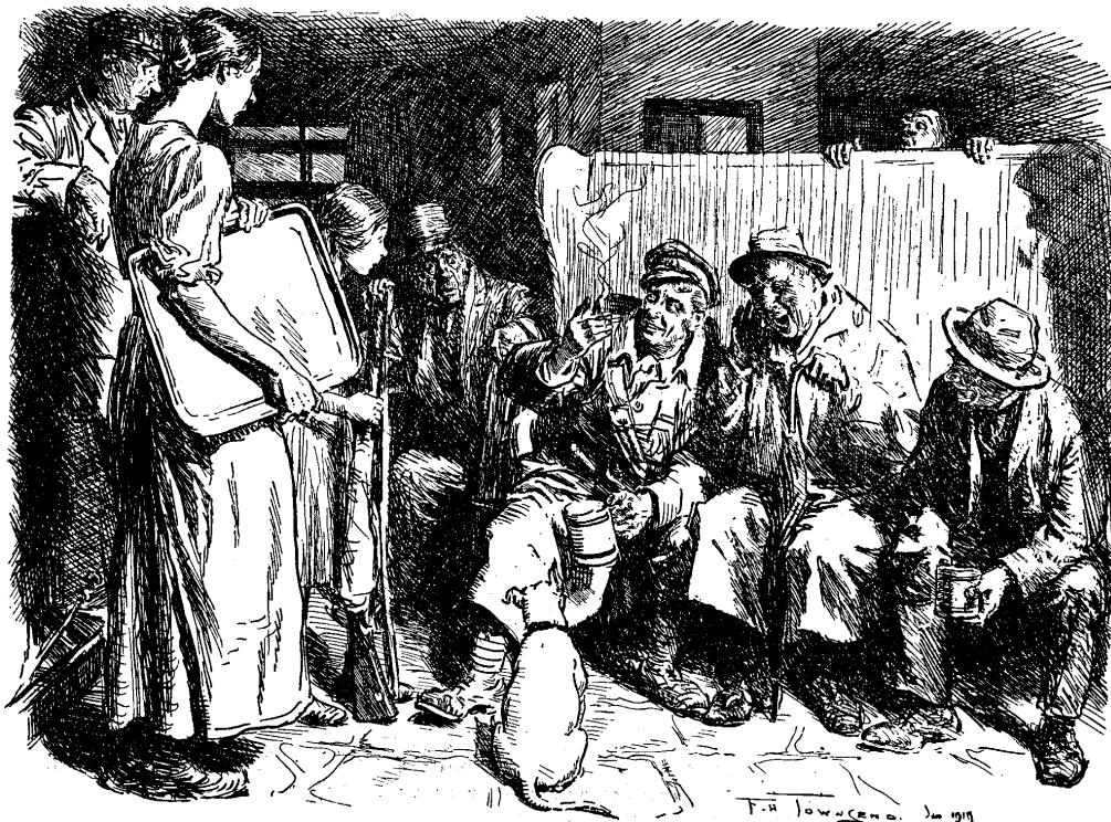
Tommy (homeward bound, and determined not to disappoint). "WHY, MISSY, THREE DAYS BEFORE THE ARMISTICE THE AIR WAS THAT THICK WITH AEROPLANES THE BIRDS HAD TO GET DOWN AND WALK."

"Here at last is an actual invasion! Prussian officers landing on our defenceless shores, on the transparently flimsy pretext of making themselves acquainted with our military establishments, at the rate (excluding Sundays) of 240 a week, or in this present September, of 1,080 a month, or, amazing and terrifying total, of 12,520 a year! We commend this startling announcement to the attention of the Cabinet (Parliament, unfortunately, is not sitting), the Commander-in-Chief, the War Office, the Commanders of all Volunteer Corps, the Author of 'The Battle of Dorking,' Sergeant Blower , and Cheeks the Marine ."