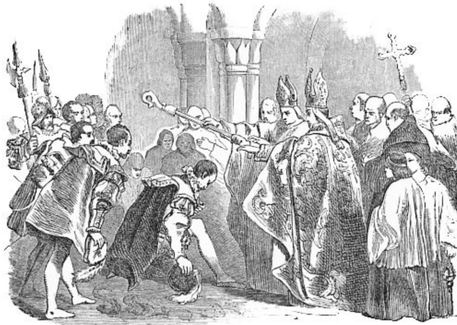
THE ACT OF ABJURING PROTESTANTISM.

The Archbishop of Bourges was seated at the entrance of the church in a chair draped with white damask. The Cardinal of Bourbon, and several bishops glittering in pontifical robes, composed his brilliant retinue. The monks of St. Denis were also in attendance, clad in their sombre attire, bearing the cross, the Gospels, and the holy water. Thus the train of the exalted dignitary of the Church even eclipsed in splendor the suite of the king.