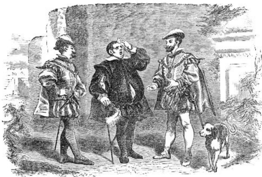
THE RECONCILIATION WITH MAYENNE.

"There's my hand," exclaimed the kind-hearted king, again cordially embracing the duke. "Take it, for, on my life, this is all the vengeance I shall ever seek."