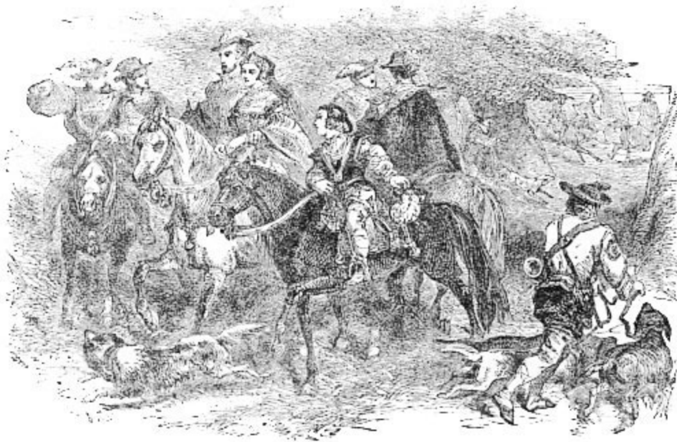
THE FLIGHT OF THE QUEEN OF NAVARRE.

Queen of France received her with every possible mark of respect and affection, and lavished upon her entertainments, and fêtes, and gorgeous spectacles until the Queen of Navarre was almost bewildered.