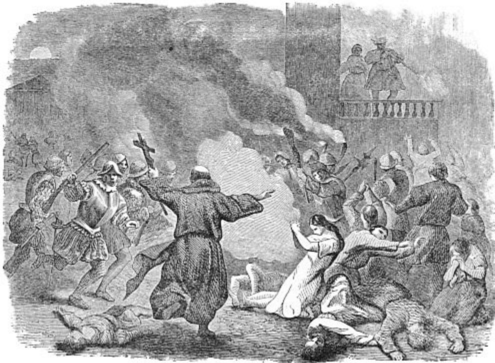
THE MASSACRE OF ST. BARTHOLOMEW.

Just before the carnage commenced, Marguerite, weary with excitement and the agitating conversation to which she had so long been listening, retired to her private apartment for sleep. She had hardly closed her eyes when the fearful outcries of the pursuers and the pursued filled the palace. She sprang up in her bed, and heard some one struggling at the door, and shrieking "Navarre! Navarre!" In a paroxysm of terror, she ordered an attendant to open the door. One of her husband's retinue instantly rushed in, covered with wounds and blood, pursued by four soldiers of her brother's guard. The captain of the guard entered at the same moment, and, at the earnest entreaty of the princess, spared her the anguish of seeing the friend of her husband murdered before her eyes.