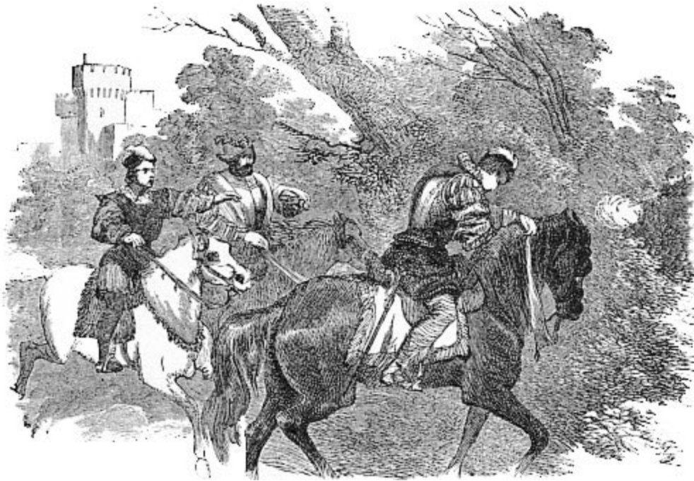
THE ASSASSINATION OF FRANCIS, DUKE OF GUISE.

He immediately fell upon his horse's neck, and was caught in the arms of his friends. They conveyed him to the castle, where the duchess received him with cries of anguish. He embraced her tenderly, minutely described the circumstances of his assassination, and expressed himself grieved in view of the stain which such a crime would inflict upon the honor of France. He exhorted his wife to bow in submission to the will of Heaven, and kissing his son Henry, the Duke of Joinville, who was weeping by his side, gently said to him,