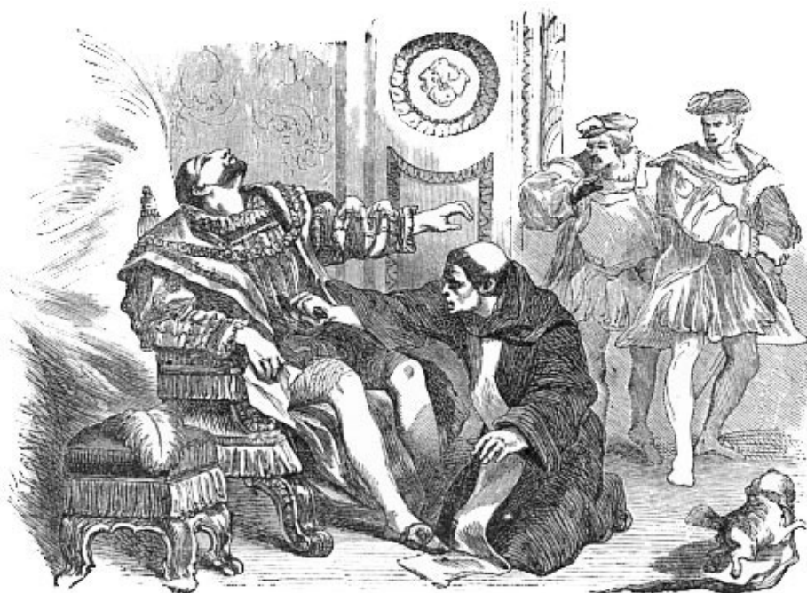
THE ASSASSINATION OF HENRY III.