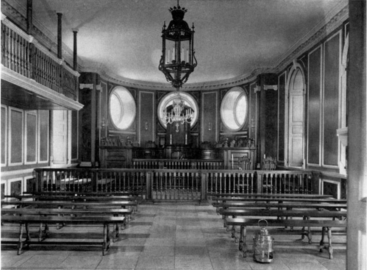
The General Court in the Old Capitol at Williamsburg.

The Burgesses were deeply concerned. In an address to the Lieutenant Governor they declared that their duty in the discharge of the trust reposed in them by the people required them to ask him by what authority he demanded the fee. He replied that he had acted on his own authority, with the advice of the Council. And he intimated that the taking of the fee was a thing that did not concern them.