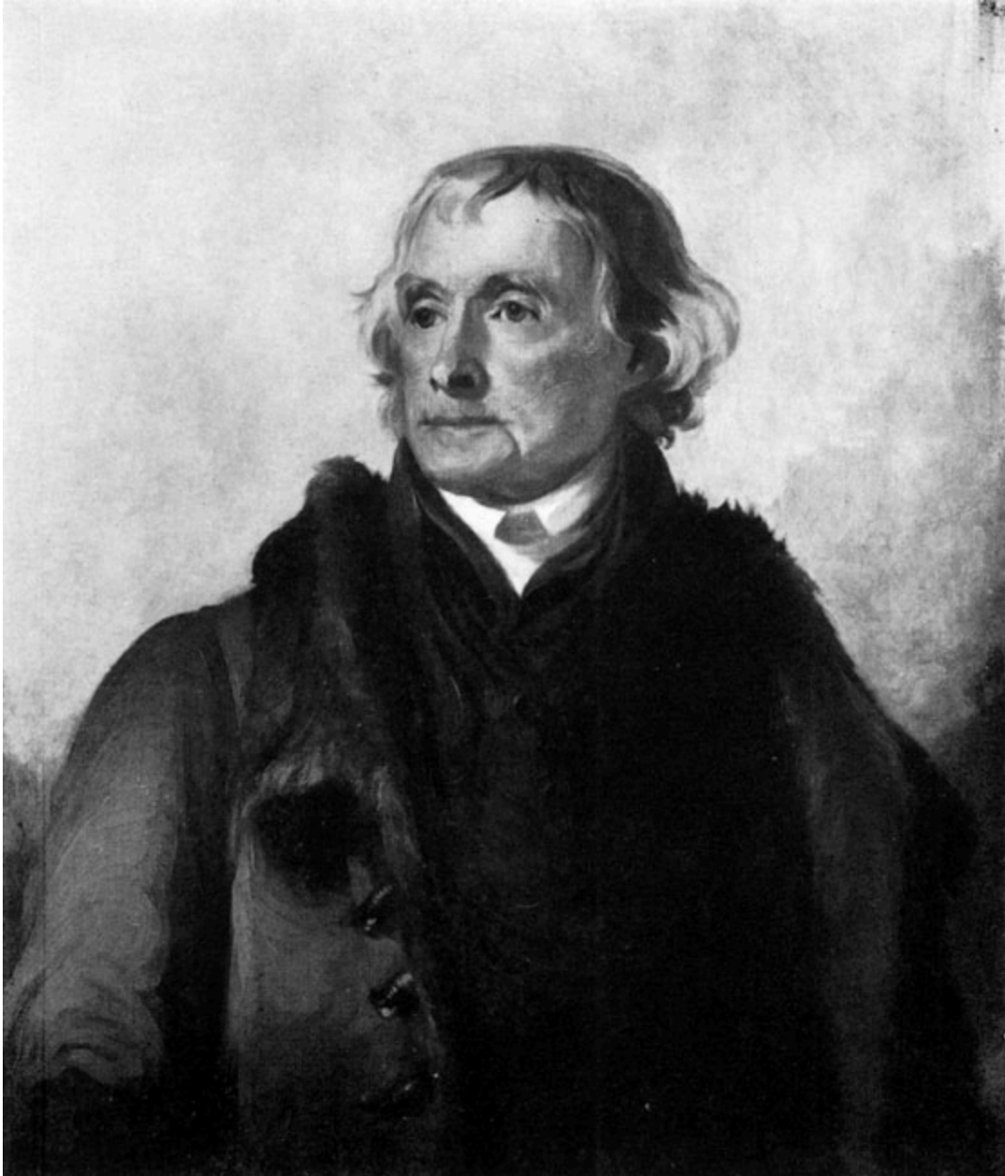
Thomas Jefferson. Portrait by Thomas Sully in the Hall of the American Philosophical Society.