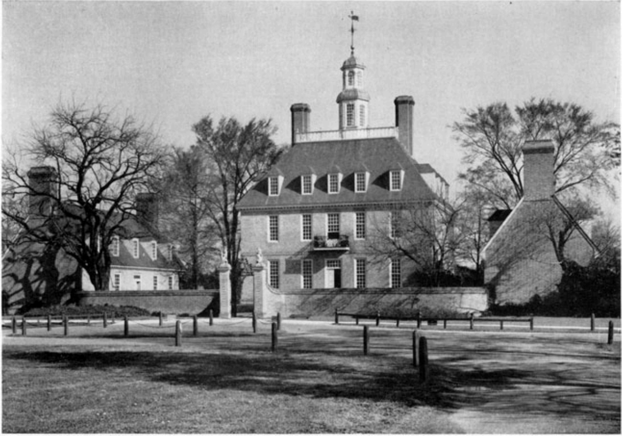
The Governor's Palace, Williamsburg.

The resolution stated that it was necessary to have a day of "fasting, humiliation, and prayer, devoutly to implore the divine interposition for averting the heavy calamity which threatens destruction to our civil rights, and the evils of civil war; to give us one heart and mind firmly to oppose, by all just and proper means, every injury to American rights; and that the minds of his Majesty and his Parliament may be inspired from above with wisdom, moderation, and justice to remove from the loyal people of America all cause of danger from a continued pursuit of measures pregnant with ruin." Dunmore thought the resolution reflected on the King and Parliament, and so made it necessary for him to dissolve the Assembly. [17]