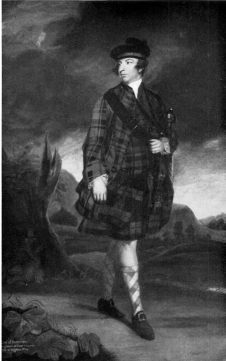
Lord Dunmore. From the copy in the possession of the Virginia Historical Society of the original portrait by Sir Joshua Reynolds.