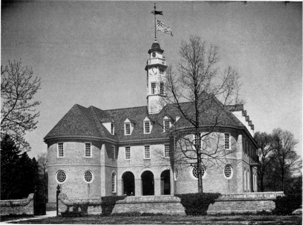
The Old Capitol at Williamsburg, showing the north elevation which is a duplicate of the historic Virginia Capitol originally completed in 1705.