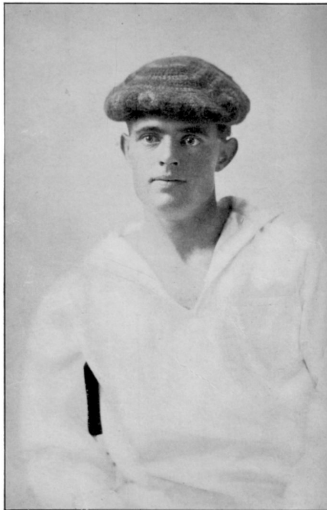
Jack London, Sailor

The Project Gutenberg eBook, Dutch Courage and Other Stories, by Jack London