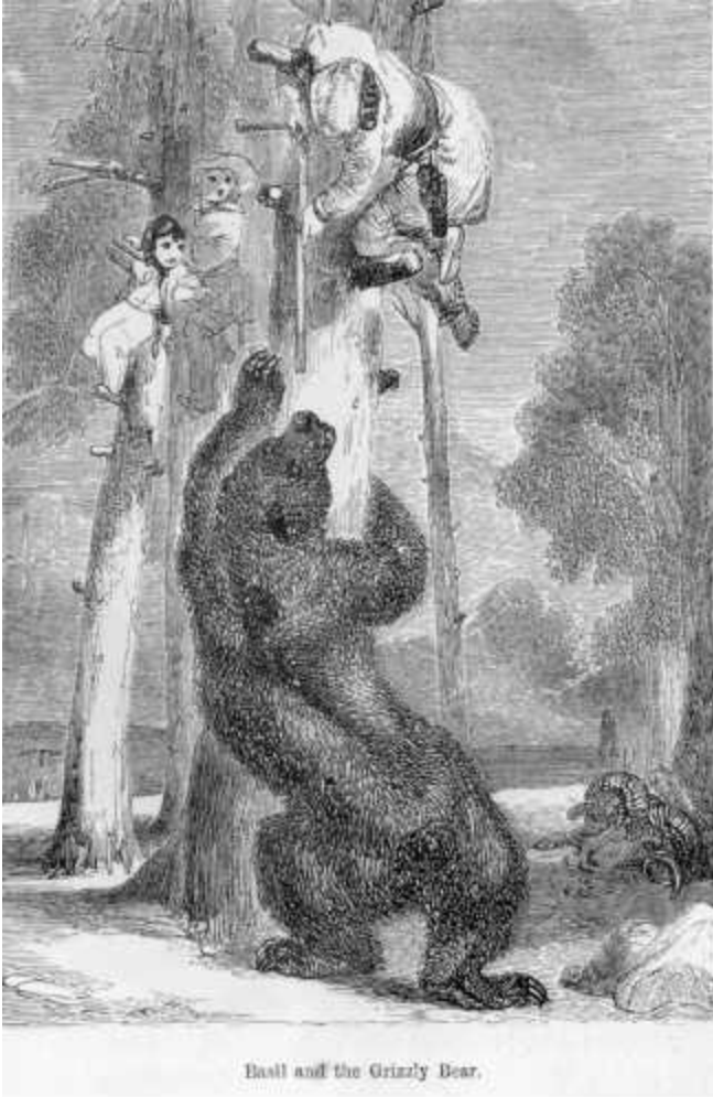
Basil and the Grizzly Bear.

They could make no change in their situation. Their guns were upon the ground, where in their haste they had flung them. They dared not descend to recover them. They were utterly helpless; and could do nothing but await the result. As if to tantalise them, they now beheld for the first time the objects of their far expedition—the animals they had so long desired to come up with—the buffaloes ! Away to the south-west a multitude of black bodies were seen upon the plain, like crowds of men in dark clothing. They were moving to and fro, now uniting in masses, and now separating like the squadrons of an irregular army. Miles of the green prairie were mottled by their huge dark forms, or hidden altogether from the view. They seemed to be moving northward, along the level meadows that stretched between