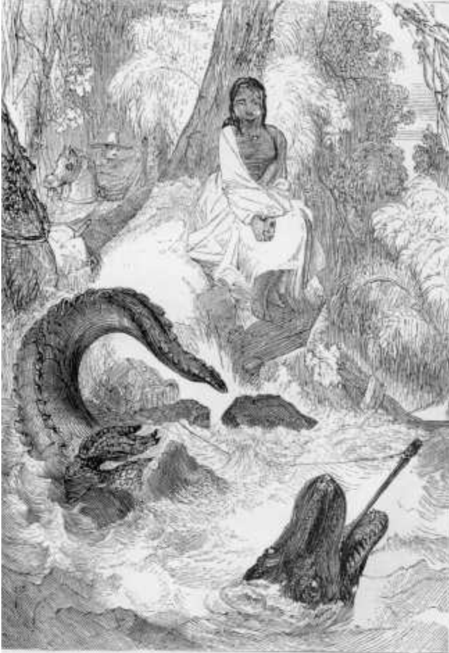
The Indian Mother and Caiman.

“The caimans do not masticate their food. Their teeth are not formed for that. They are only made for seizing; and the tongue—which they cannot extend forward—only serves to assist them in swallowing. In a few moments the body had disappeared down the capacious throat of the monster.