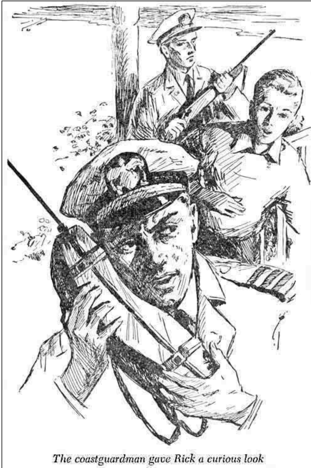
The coastguardman gave Rick a curious look

The boat carrying the Morrises—for so Rick was already conditioning himself to think of them—was approaching the dock. As the group hurried