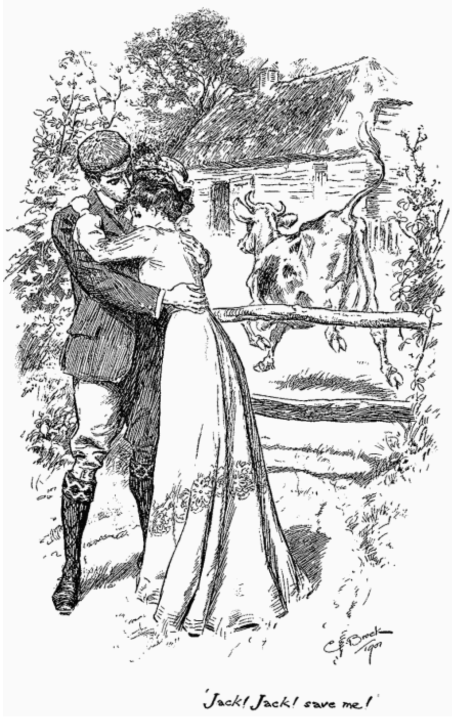
'Jack! Jack! save me!'