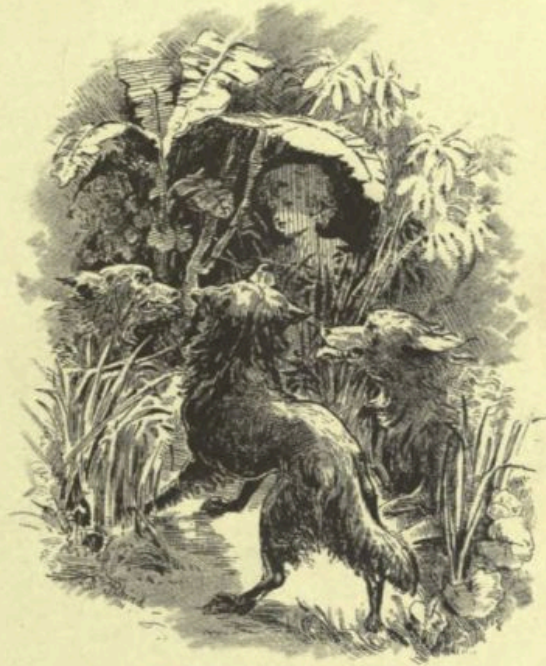
THE WOLF'S LAIR