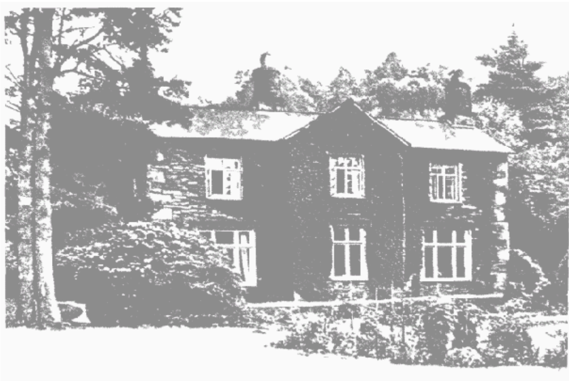
FOX HOW, THE WESTMORELAND HOME OF THE ARNOLDS.