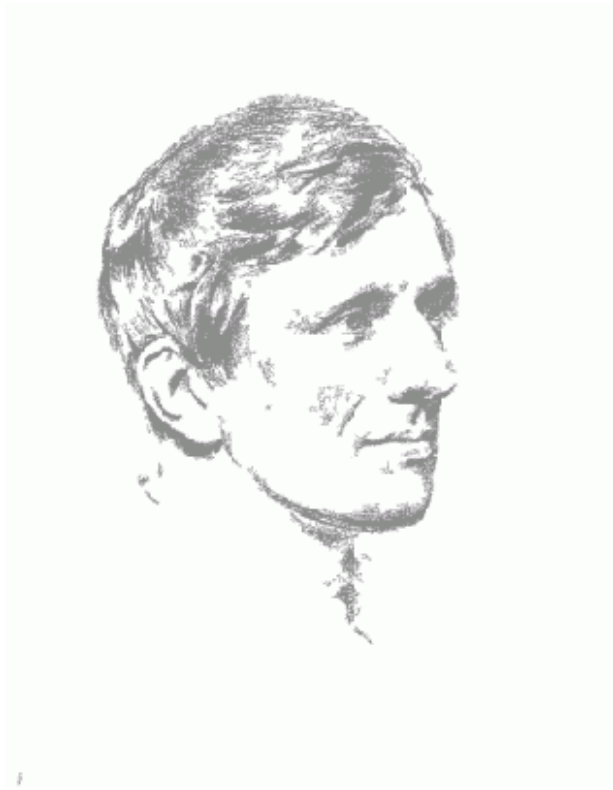
JOHN HENRY NEWMAN. From a drawing in possession of