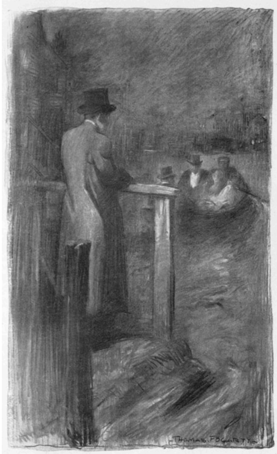
The boat gathered impetus.