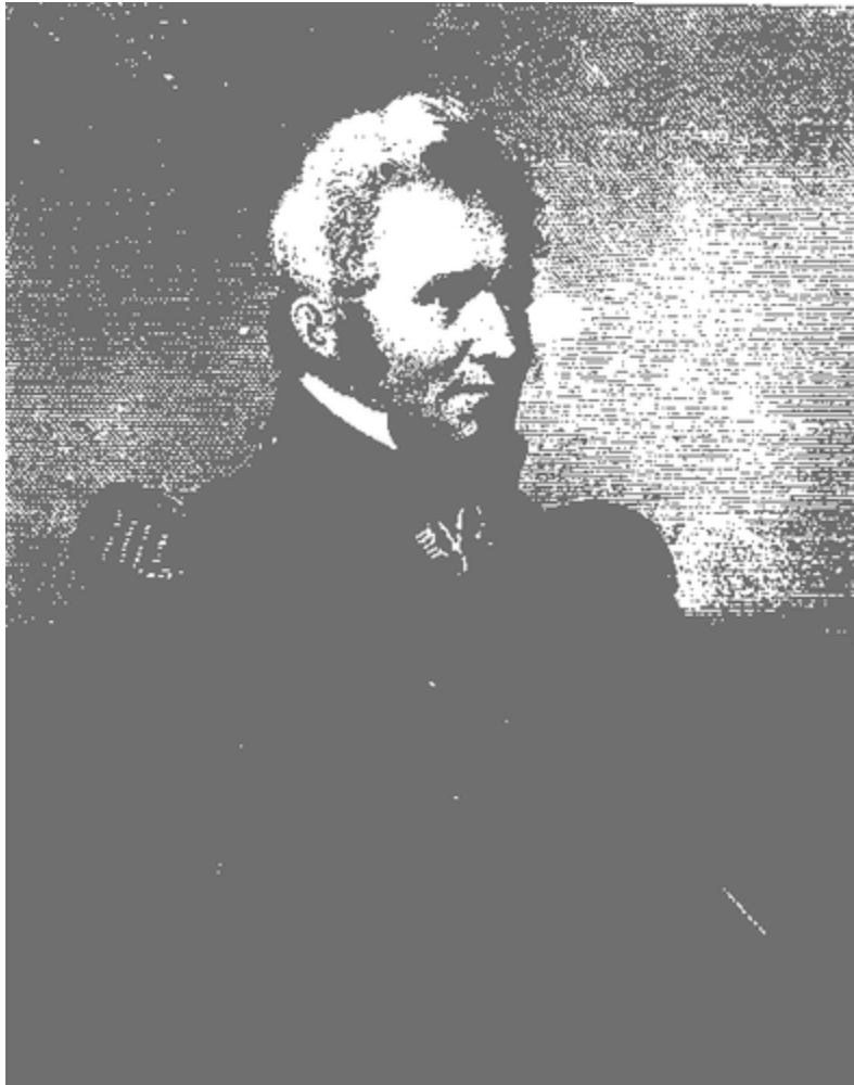
LT.-COL CHARLES DE SALABERRY.

SKETCH OF THE BATTLE OF CHATEAUGUAY—OCT 26, 1813.