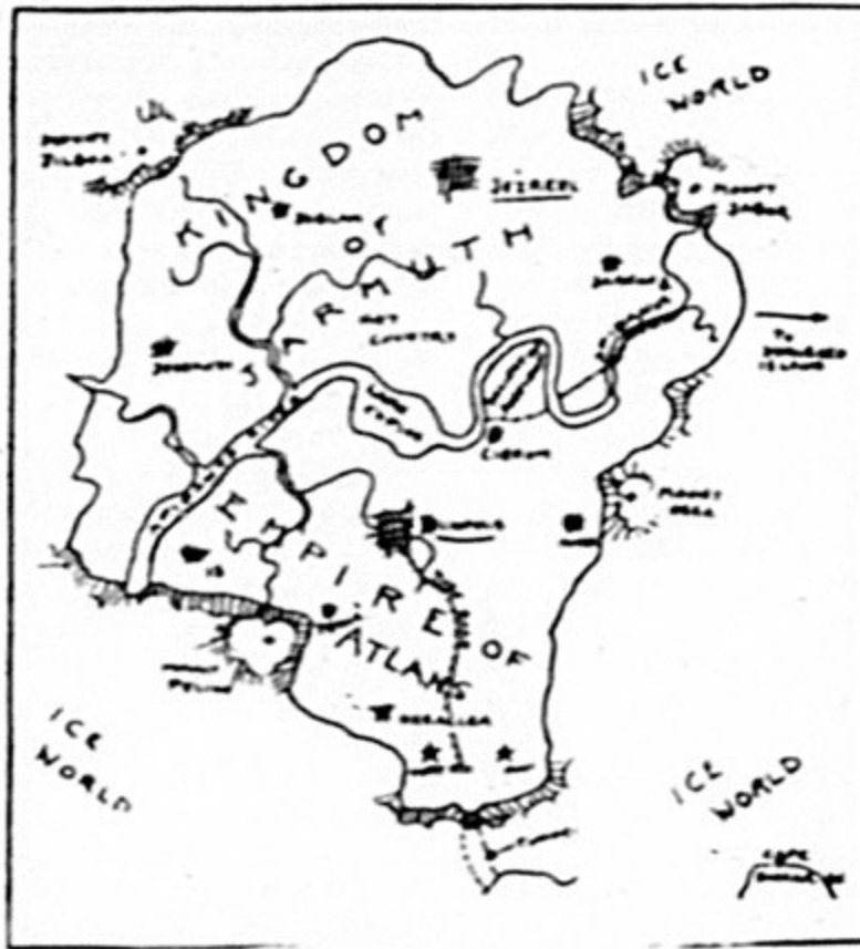
Map of Jarmuth and Atlans

hothead! I prithee pause a moment! Remember how the dark-haired Wanderer once aided our imprisoned Emperor, whom Poseidon protect! Perchance, Hero Nelson and his friend once more can aid us in this, our hour of need."