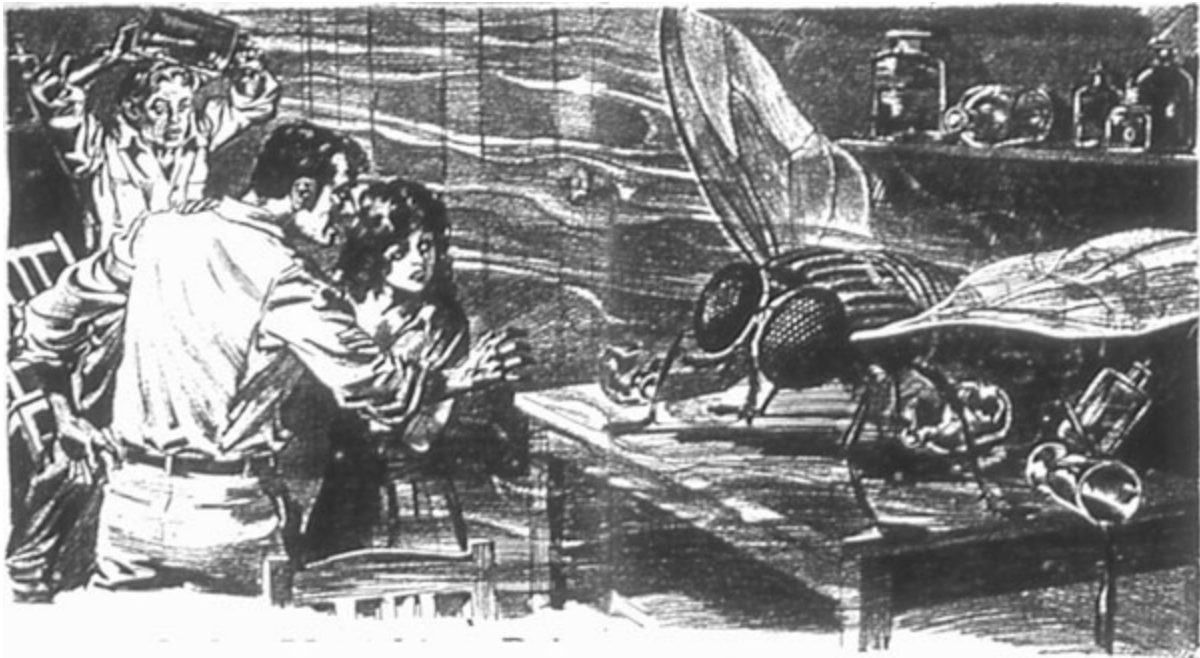
The fly landed with a thud on the center table.

"Using a device of this sort to perform such operations around a laboratory will save a great deal of a chemist's time. Its electric eye is about 165 times as sensitive to differences in color as any human eye."