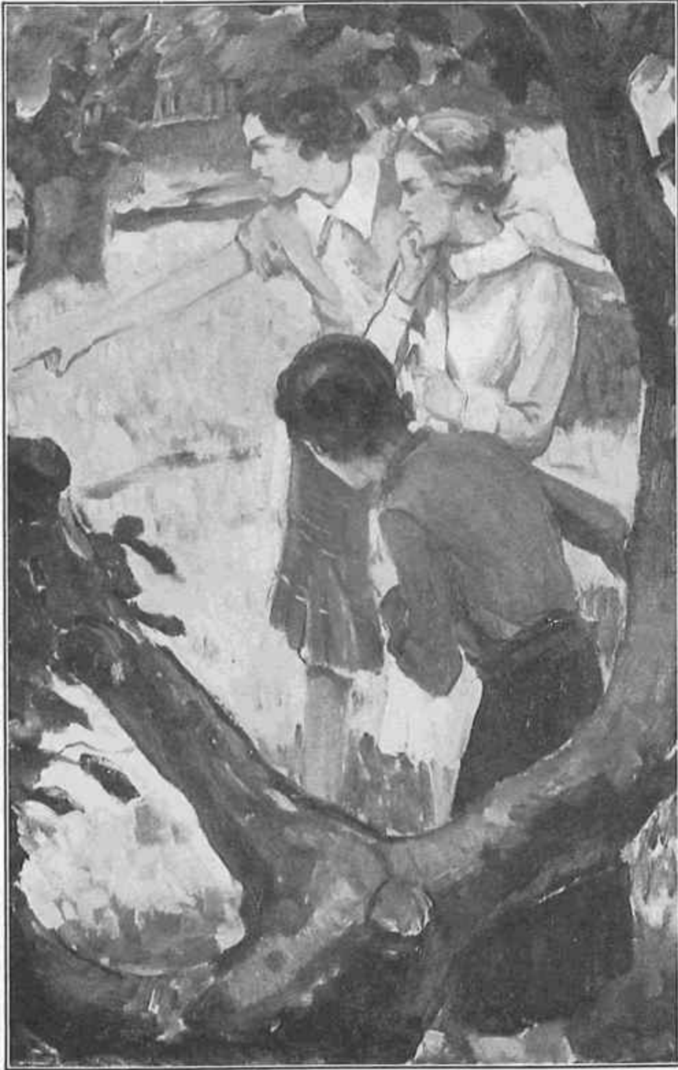
“Oh-h-h-h-e-e!” screamed Sim, “Oh, girls, look here!” (Frontispiece) (THE ORCHARD SECRET)