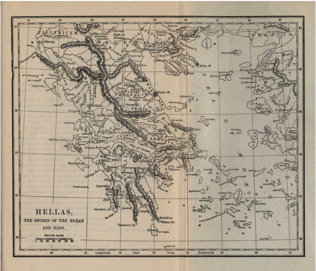
Map--HELLAS, THE SHORES OF THE ÆGEAN AND ILIOS.