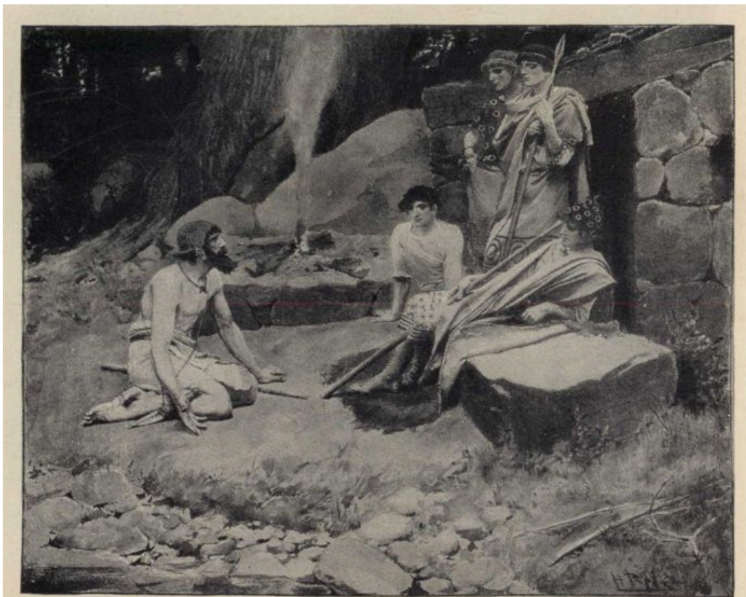
THE SWINEHERD TELLING HIS STORY TO ODYSSEUS.

"Do tell us," said Odysseus, "how this great change was made in your life. Was the goodly town in which your father and your lady mother dwelt, laid waste by an enemy? Or did unfriendly men find you in the fields alone, and sell you to him who would pay the goodliest price?"