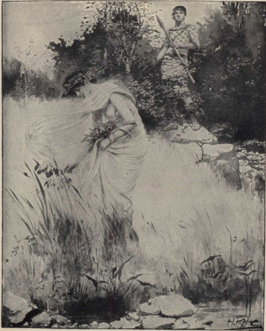
ALPHEUS AND ARETHUSA.