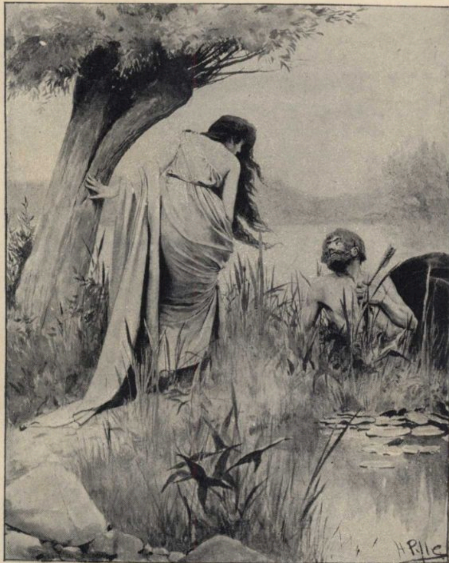
DEIANEIRA AND THE DYING CENTAUR NESSUS.

Iphitus. Her name is Iole; and it was for the sake of her beauty that Heracles destroyed her father's city.'