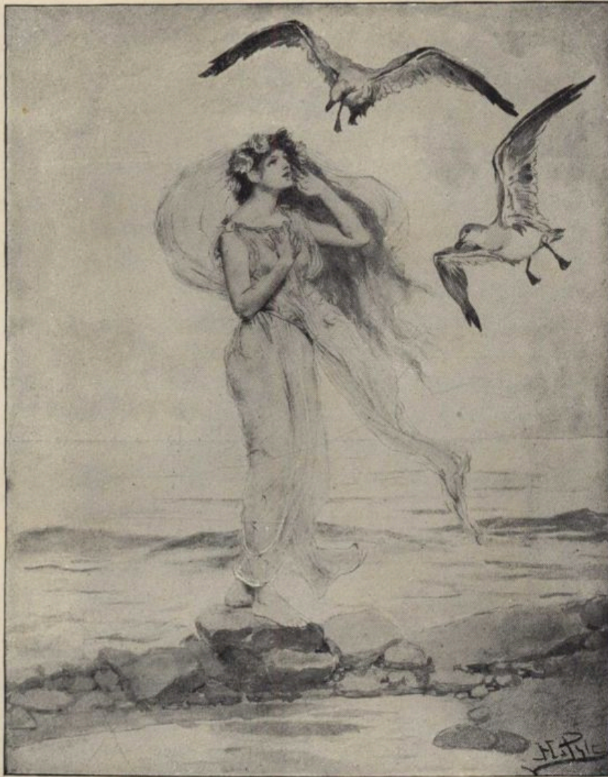
THE SILVER-FOOTED THETIS RISING FROM THE WAVES.