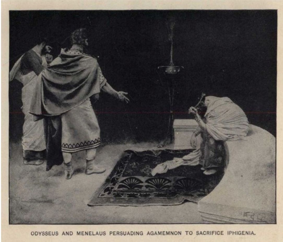
ODYSSEUS AND MENELAUS PERSUADING AGAMEMNON TO SACRIFICE IPHIGENIA.