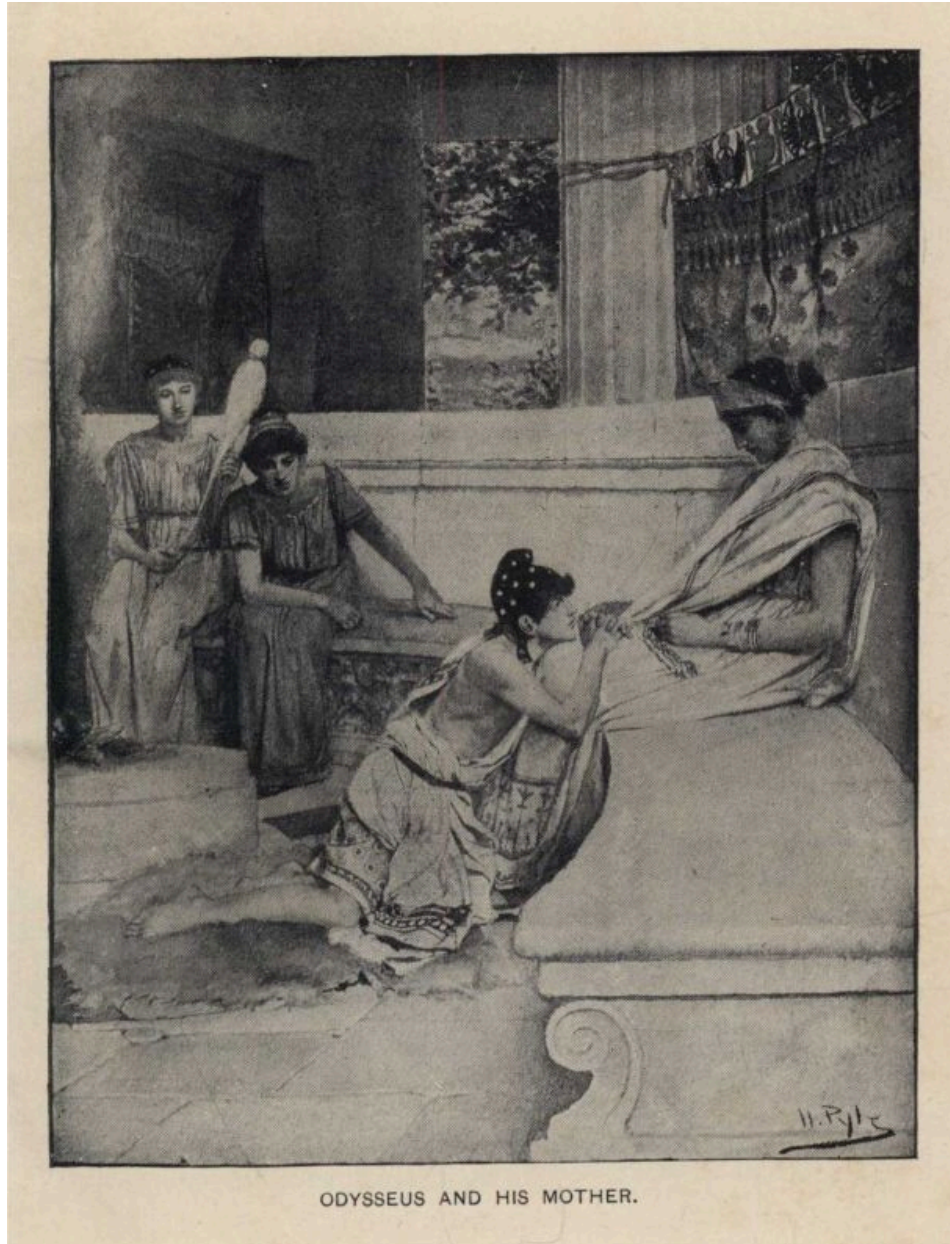
ODYSSEUS AND HIS MOTHER.