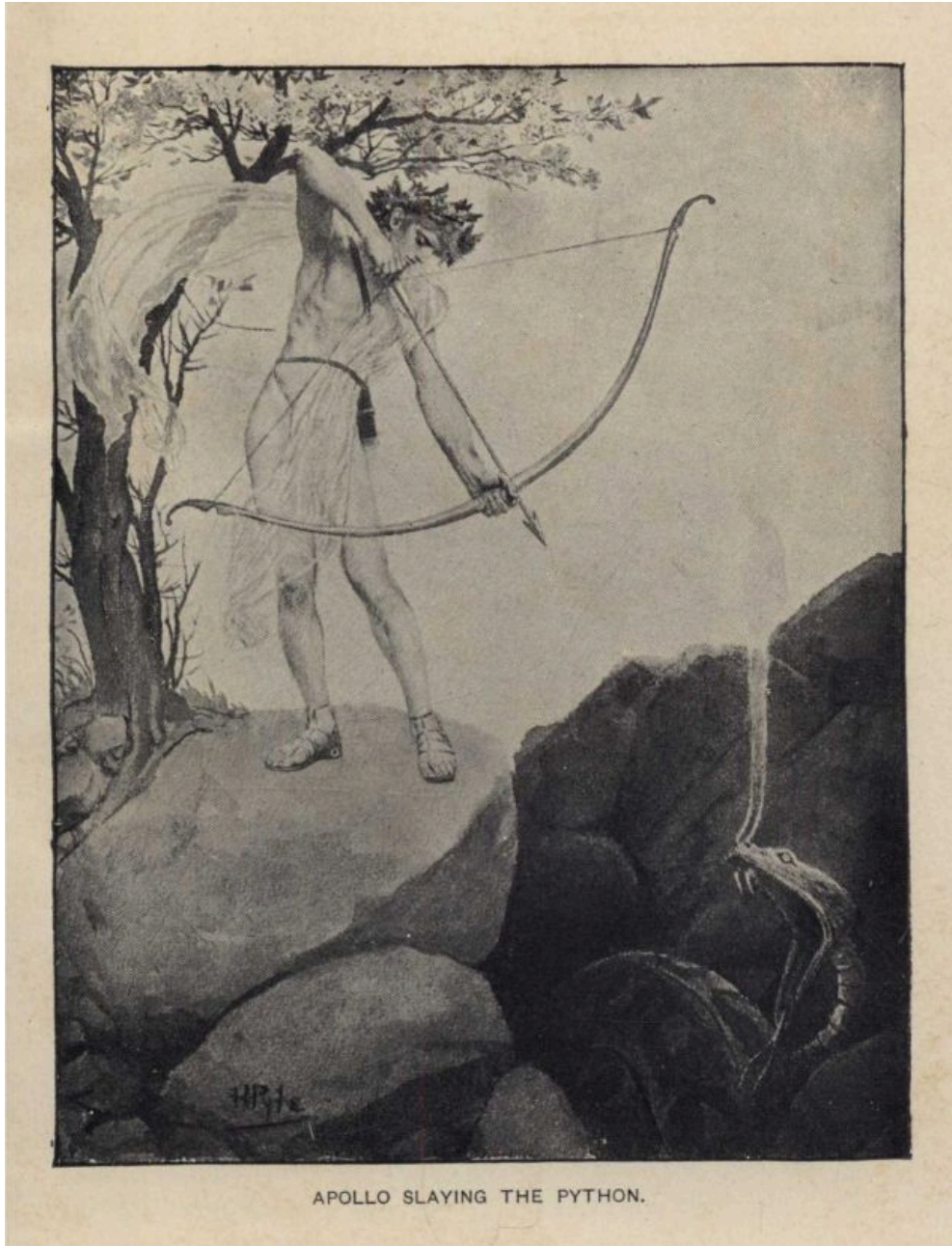
APOLLO SLAYING THE PYTHON.