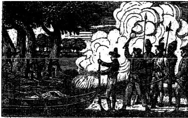
The Spaniard, &c. burning the Indian canoes.

"Though the savages, as already mentioned, had destroyed our bower, and all our corns, grapes, &c. yet we had still left our flock of cattle in the valley, by the cave, with some little corn that grew there, and the plantation of Will Atkins and