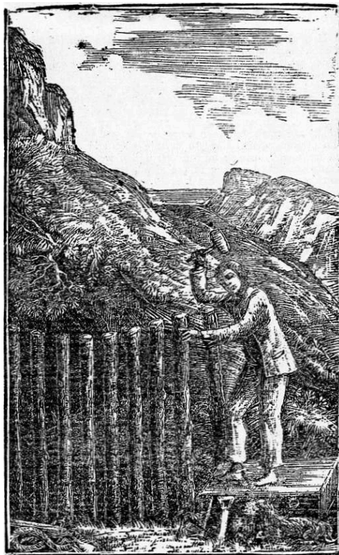
Robinson Crusoe building his castle.

descent every way to the low grounds by the sea-side, lying on the N. W. side of the hill, so that it was sheltered from the excessive heat of the sun. After this, I drew a semi-circle, containing ten yards in a semi-diameter, and twenty yards in the whole, driving down two rows; of strong stakes, not 6 inches from each other. Then with the pieces of cable which I had cut on board, I regularly laid them in a circle between the piles up to their tops, which were more than five feet out of the earth, and after drove another row of piles looking within side against them, between two or three feet high, which made me conclude it a little impregnable castle against men and beasts. And for my better security I would have no door, but entered in and came out by the help of a ladder, which I also made.