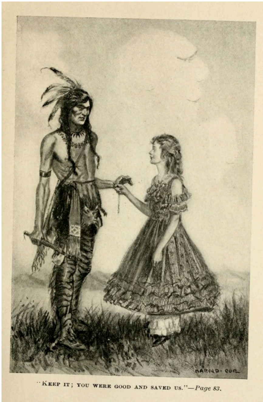
"KEEP IT; YOU WERE GOOD AND SAVED US."—Page 83.