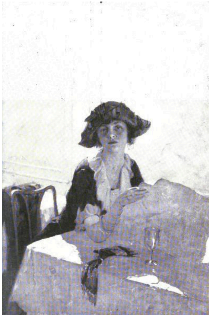
Clancy Dean, the heroine of "Find the Woman"—from the painting by Dean Cornwell