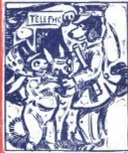
"Thank You," said the good Policeman Dog.