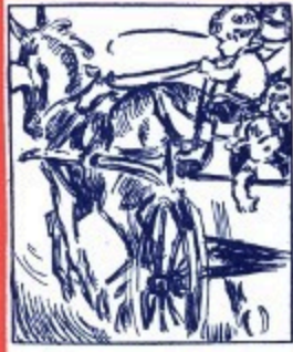
And away went the old brown horse.