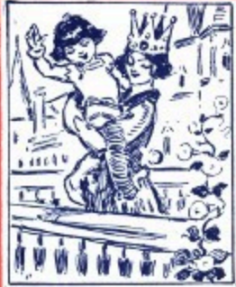
"I can speak," he shouted.