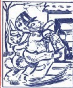
They hopped out to the Lucky mobile.