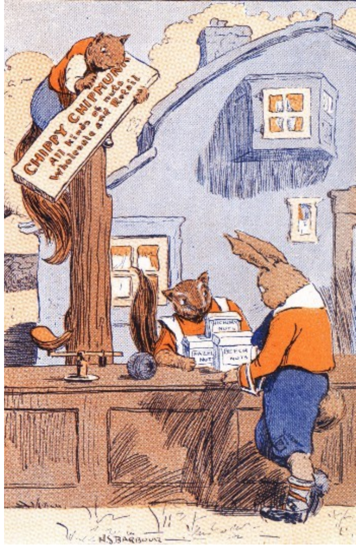
Chippy Chipmunk Shows Little Jack Rabbit His Stock of Nuts.