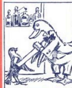
Then, he set to work.