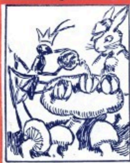
"Tell me where you come from."