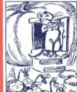
But Mr Field Mouse only smiled.