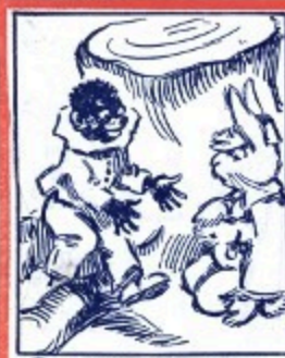
The little black man appeared.