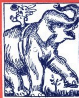
He gave a loud trumpet and went away.