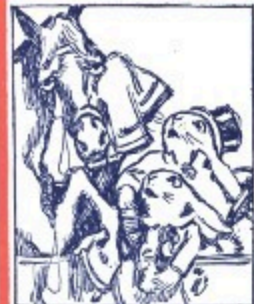
"It makes me feel sad," said the brown horse.