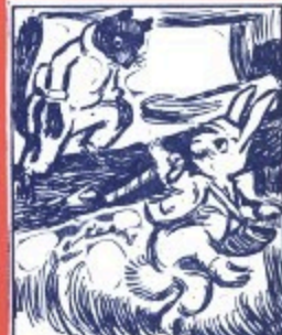
Chiffy Chiffus Recked, "Where you going, Little Bunny reverse?"