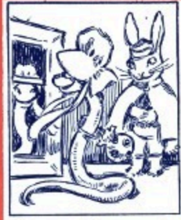
"I will go," laughed the little white snake.