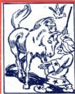
He shouted "presto change!"