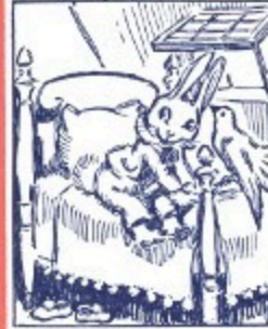
"I've got something to tell you," she whispered.