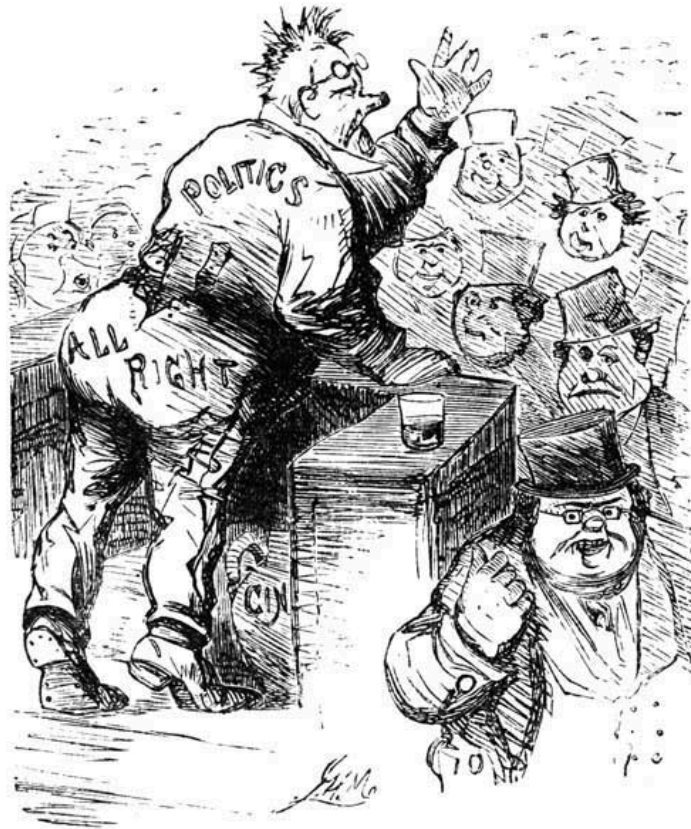
Josh Billings delivers an extemporaneous political lecture.