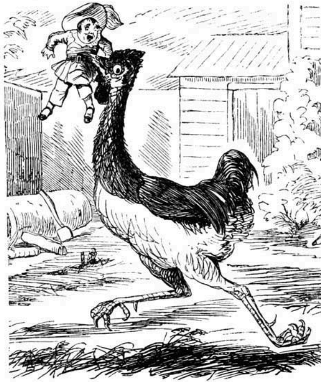
"Not enny Shanghi for me, not enny."—See page 189 .