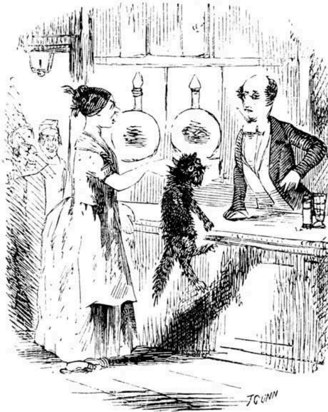
Josh Billings on Cats.—See page 40.