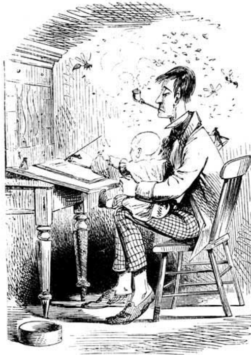
Josh Billings at home.—Preparing his new Lecture.