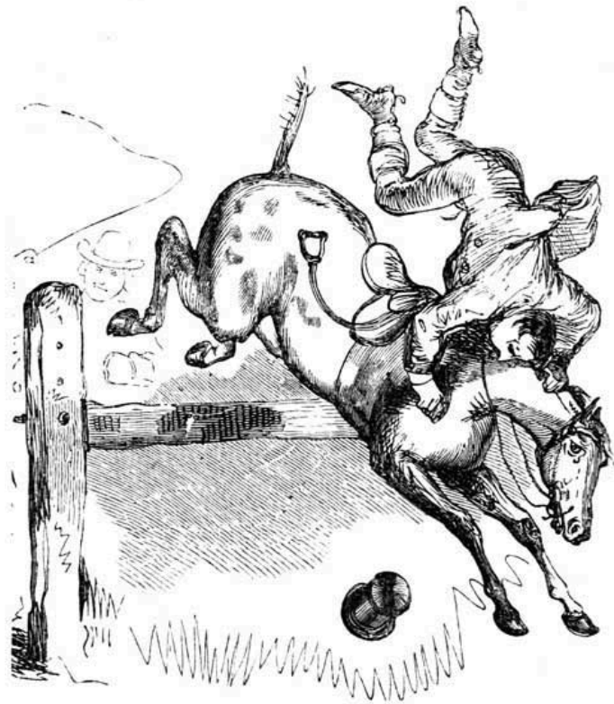
Josh Billings on trotting horses.—See page 63.

Perhaps there iz no subjek that moste men agree on so well bi the gallon, but when it comes down tew a drink, that they are so full ov noshuns about, az their rum. I hav seen lots ov old-fashioned people, who never thought ov drinking tanzy, unless they put rum into it, and wouldn't no more drink a gin-coktale without nutmeg on the top ov it, than they would skim milk. Then agin their iz sum who must hav Jamaka, or the bronkeetis, one, or tuther; and sum who must hav the belly-ake 3 or 4 times a day, or they kant relish brandee and sugar. But there waz one beardless boy, over whose hed skase 14 summers had melted, who beats them awl, he actually hove a fust class mint julek away, and called for anuther, jist bekause it wouldn't suk fast enuff, through the straw; I call this letting a man's good sense git the better ov his judgment. Rum noshuns are like gitting struk with litening, the theory iz well enuff, but the praktis is a bad one tew git into.