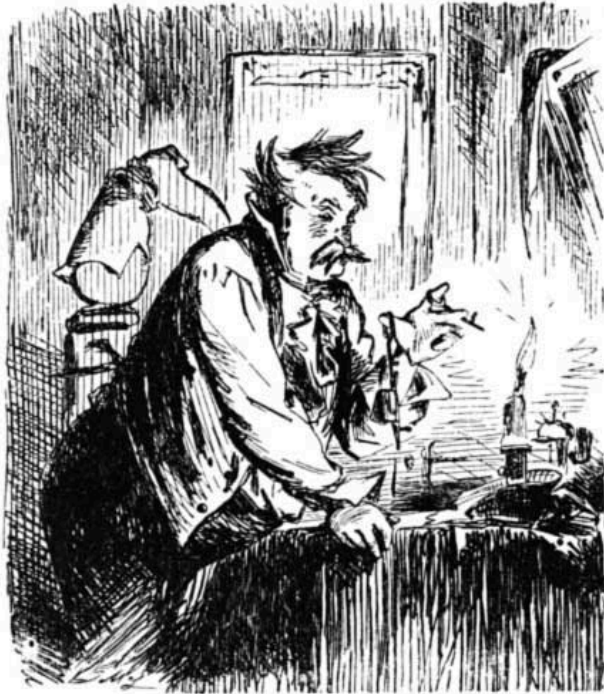
The occasional effect of Santa Cruz Rum on a gentleman of genial spirits.—See page 80 .