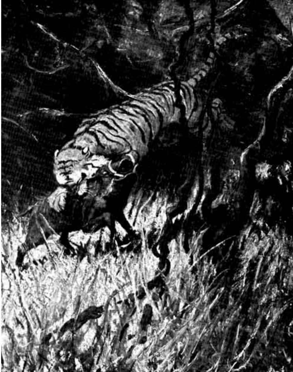
THE TIGER HAD FOUND HIS KILL

Suddenly, there was a bark followed by a deafening roar and then the thud of a leaping body falling on the ground. The tiger had found his kill. You know the tiger has three different calls—the hunger wail which is like a terrible sound cutting the jungle with hate; then the snorting bark of the tiger which means that he is nearing his prey; and then through the stillness of the jungle, one hears his third call, the triumphant roar of the kill, which means that he has found his prey. This roar has a terrible effect on the victim; it paralyzes him with terror, and like a lightning flash, along with