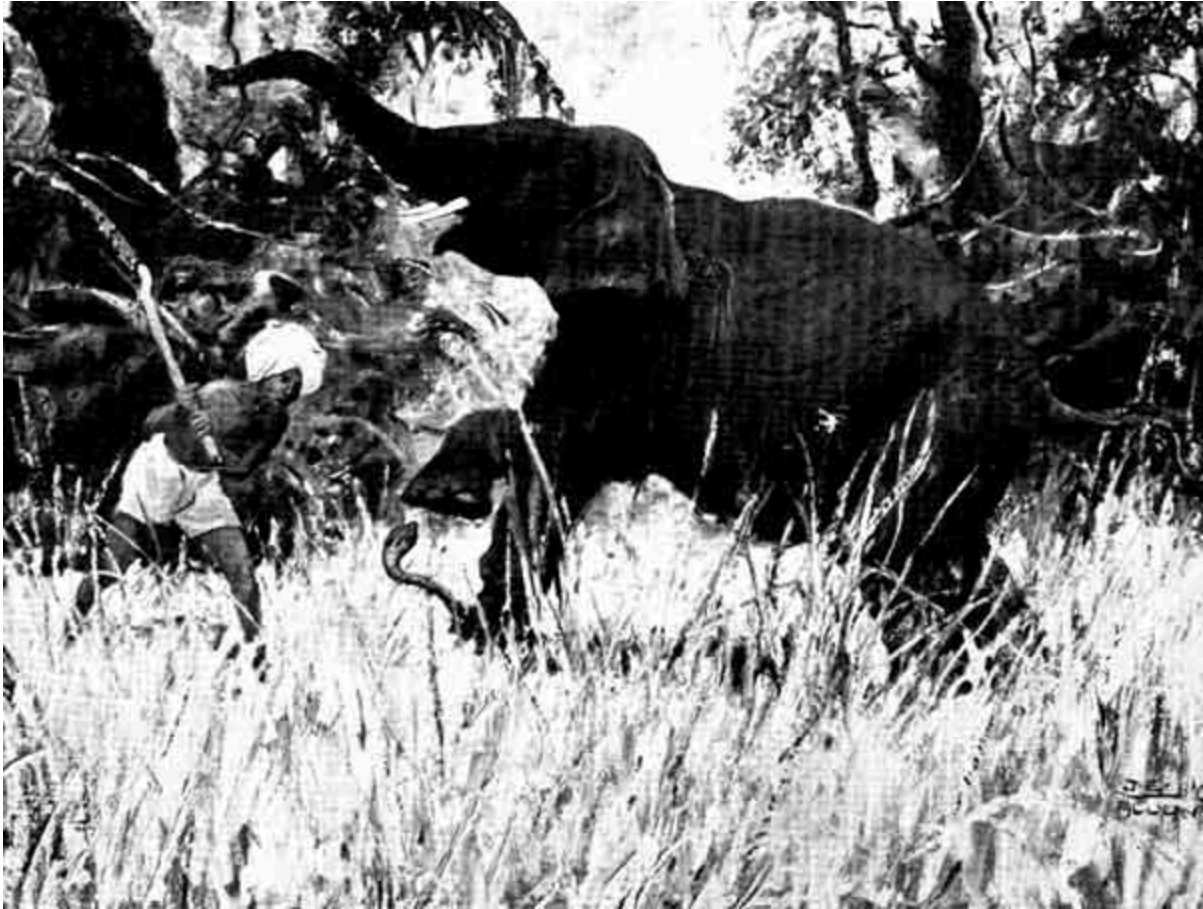
THAT VERY INSTANT THE UP-RAISED FOOT OF THE ELEPHANT WAS ON HIS HEAD

any snake can poison an elephant by stinging the end of his trunk. I hit the snake on the head with my stick, but instead of striking his head, the stick slipped down that ebony column which was still standing erect. Fortunately, in order to avert the next blow, the snake fell on his side. That very instant the up-raised foot of the elephant was on his head.