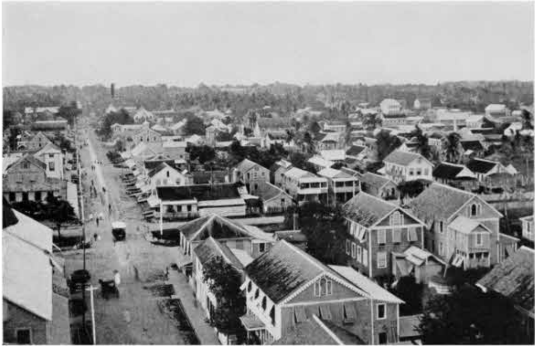
GEORGETOWN, BRITISH GUIANA.