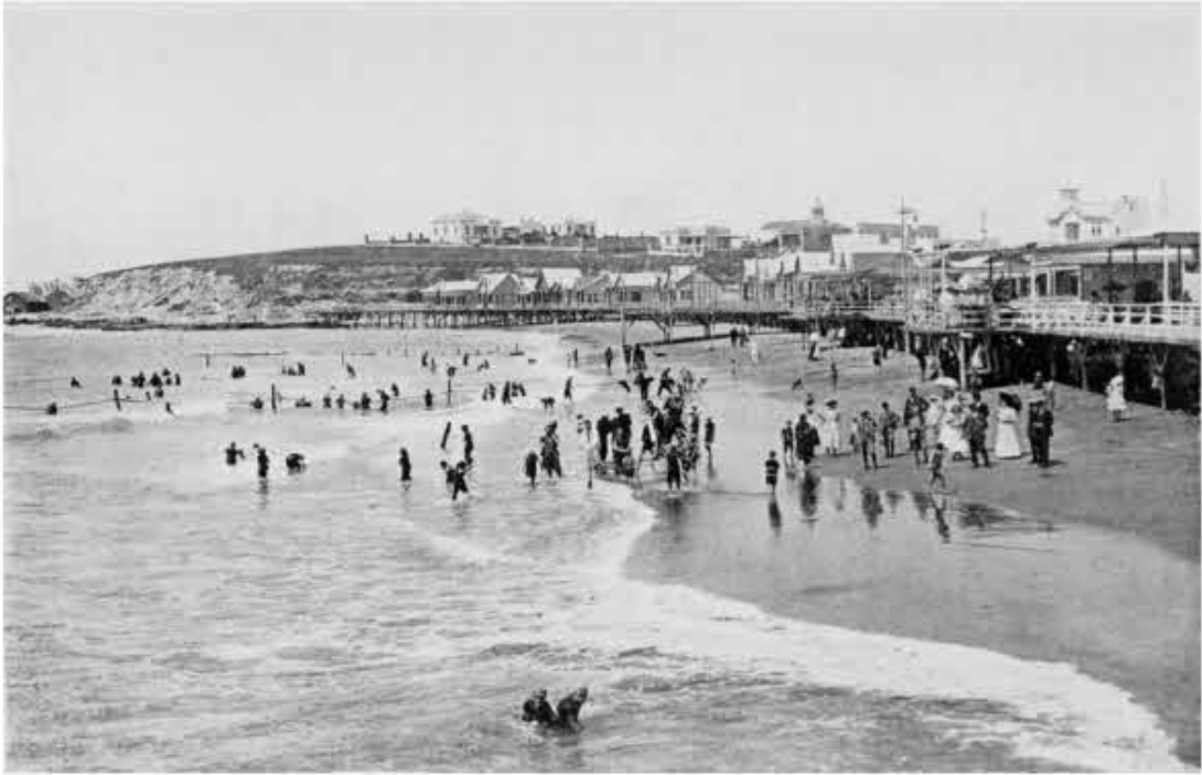
MAR DEL PLATA.