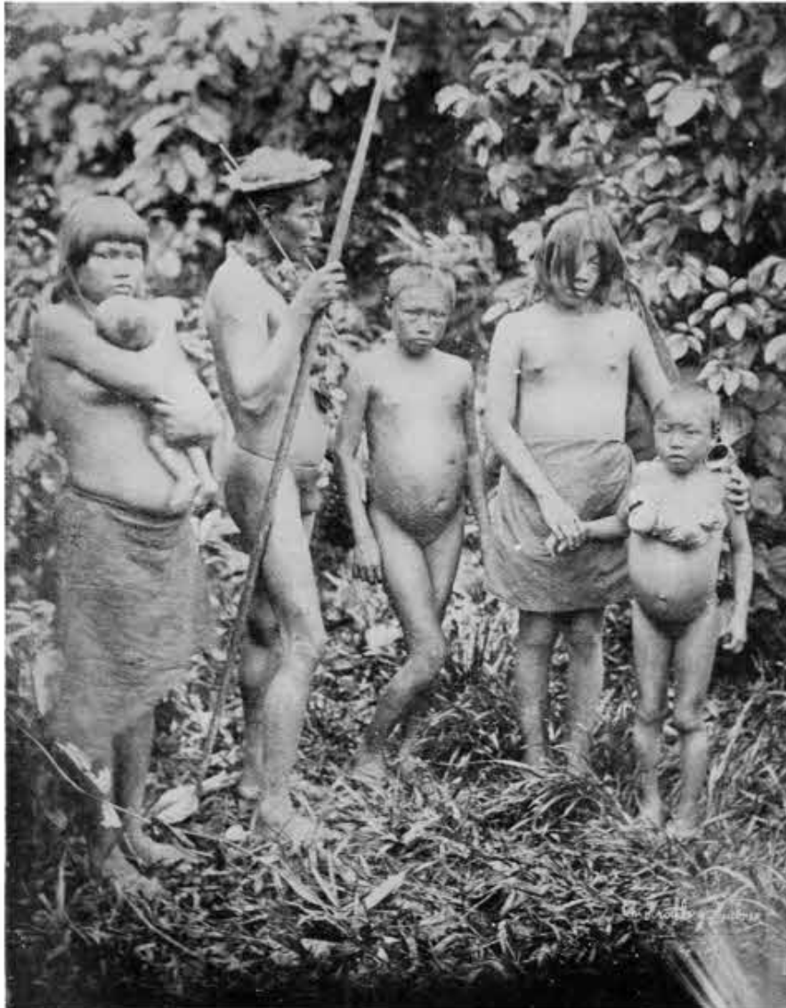
INDIANS OF THE NAPO, PERUVIAN AMAZON REGION.