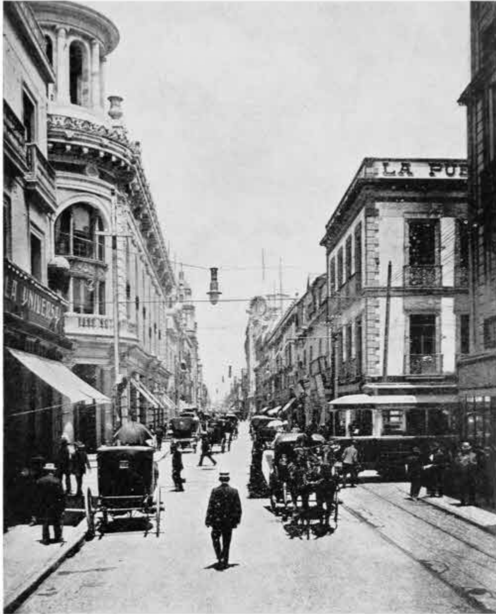
STREET IN MEXICO CITY. CATHEDRAL IN DISTANCE.