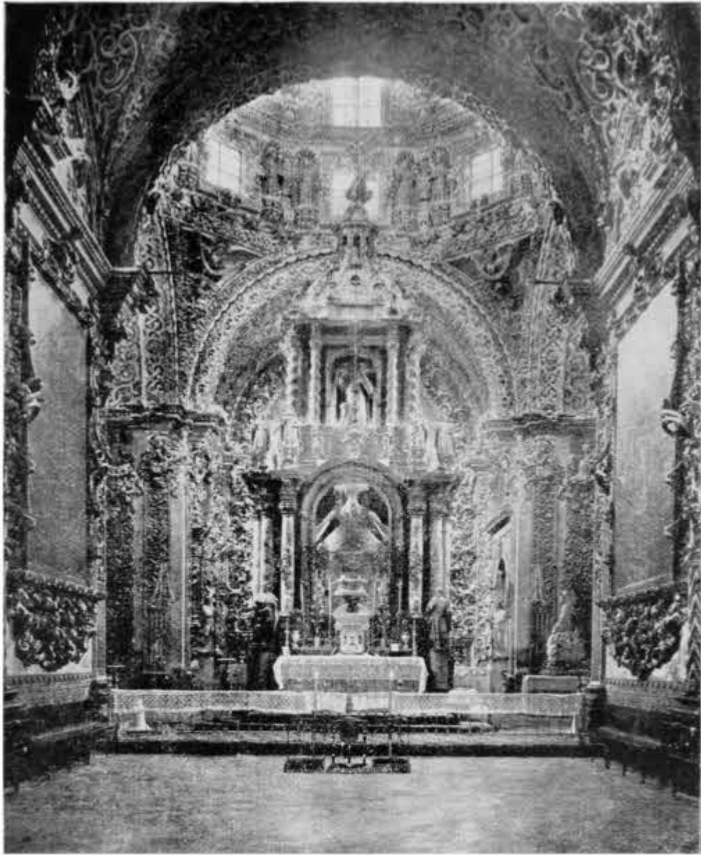
CHAPEL OF THE ROSARIO, MEXICO.

We find this custom largely in Mexican towns, in Central America, in Peru, Bolivia and the Cordillera generally—in brief, almost everywhere.