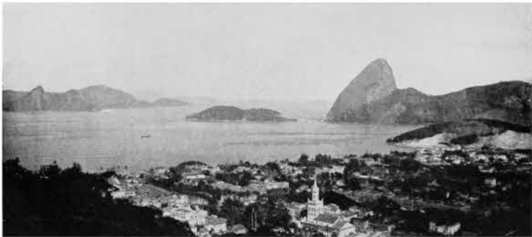
THE BAY OF RIO DE JANEIRO.

Brazil is, of course, not a Spanish American country, although it was at one period under the dominion of Spain; and it stands apart from the remainder of the great sisterhood of the Latin American Republics by reason of its Portuguese origin and language, although the common Iberian ancestry renders it similar thereto in other respects. It differs, furthermore, in the constitution of its people, in that the African negro race has been so considerably absorbed into the twenty-two million souls which form the population of the Republic: an admixture which is of considerable ethnological interest, and may have some important bearing on the future relation of the white and coloured races of the world.