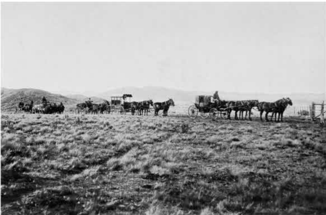
THE PAMPAS, ARGENTINA.

The early folk of these great plains were not of a meek and humble character, such as the Spaniards so often encountered. They were Indios bravos ; fighters and stubborn savages, implacably hostile. Nevertheless, they gave way in time, as destiny had decreed they should.