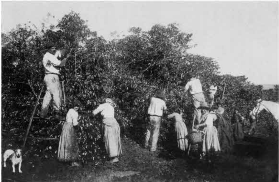
COFFEE HARVEST, BRAZIL.

In Paraná, the famous and valuable maté is largely grown, and the leaf of this small shrub—not unlike the ilex, or evergreen oak, is exported far and wide to Argentina, and other lands of the Plate, and to Chile, across the Cordillera. For Paraná, the maté is what coffee is for San Paolo.