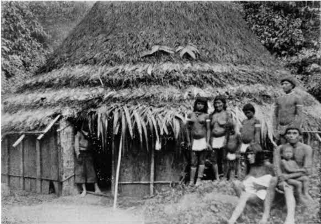
INDIANS AT HOME, GUIANA.