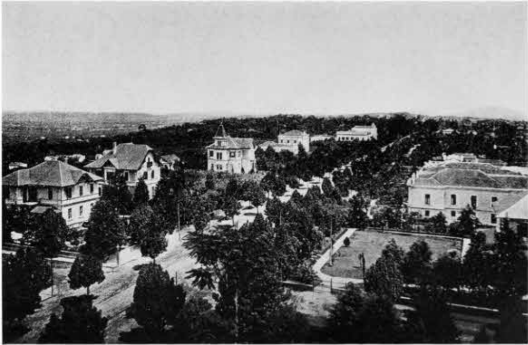
A VIEW IN SAO PAULO.

whose very name was anathema to the traveller, now a fine and fairly healthy seaport of vast importance.