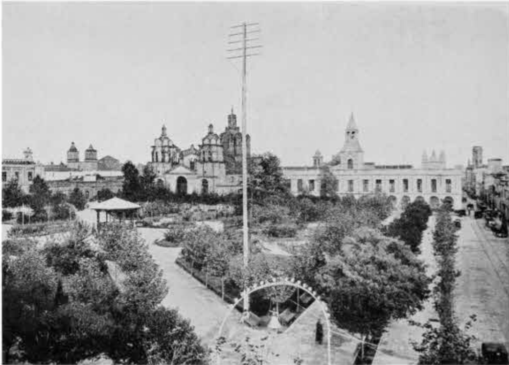
THE CITY OF CORDOBA, ARGENTINA.

supply of maize, perhaps half, but in times of drought this falls very seriously.