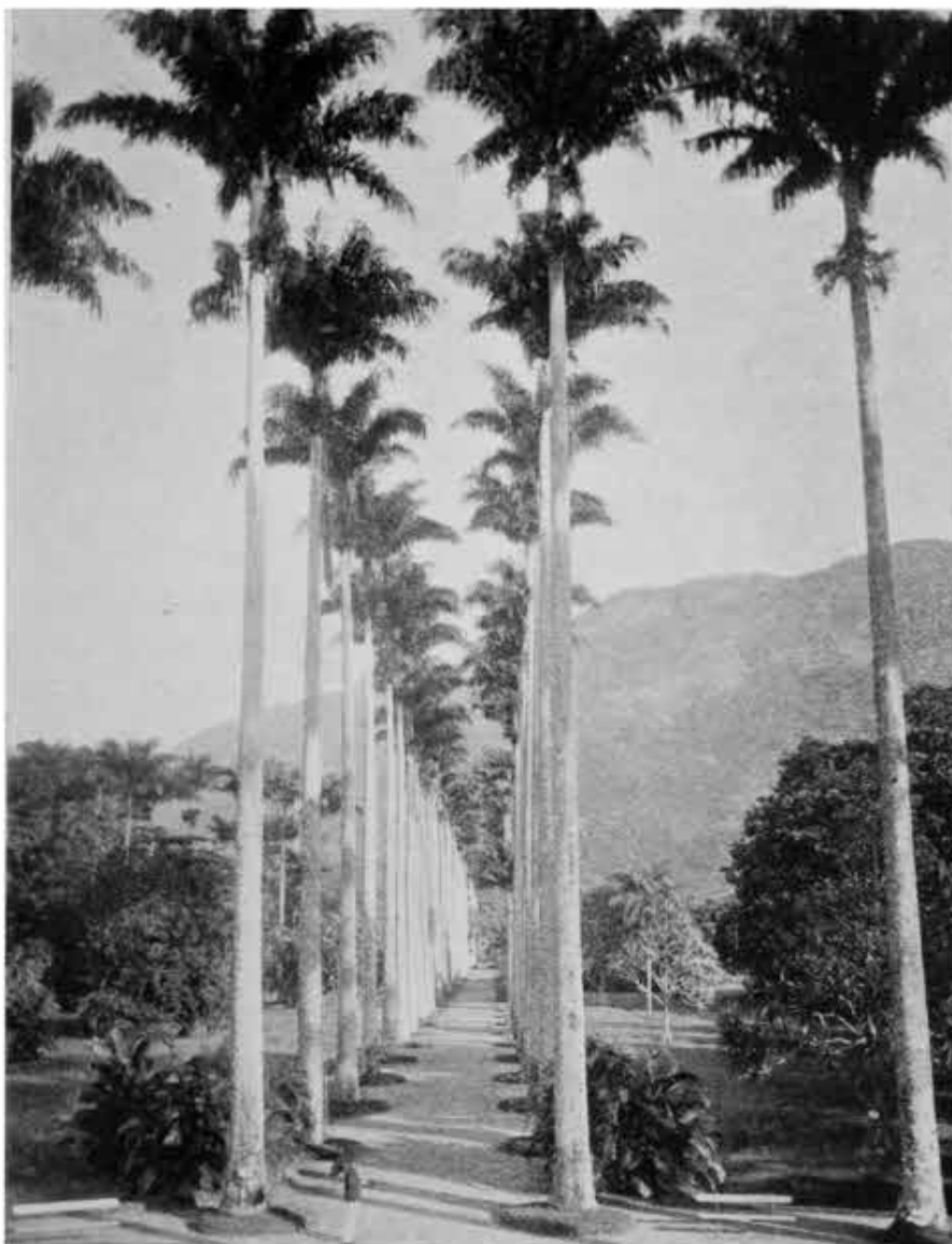
PALM AVENUE, RIO DE JANEIRO.