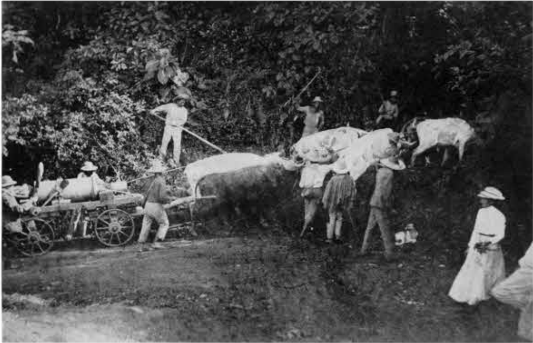
TRANSPORTING MACHINERY IN THE COLOMBIAN ANDES.

whence, if we wish, we may continue on through the pretty town of Cali, and up over the tablelands of Popayan and Pasto, and, passing the frontier, so ride on to Quito, the capital of Ecuador—a journey which will leave us with sensations both painful and pleasurable.