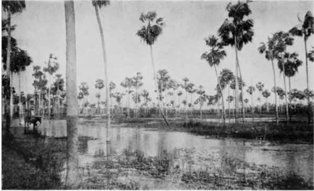
A CHACO FLOOD.