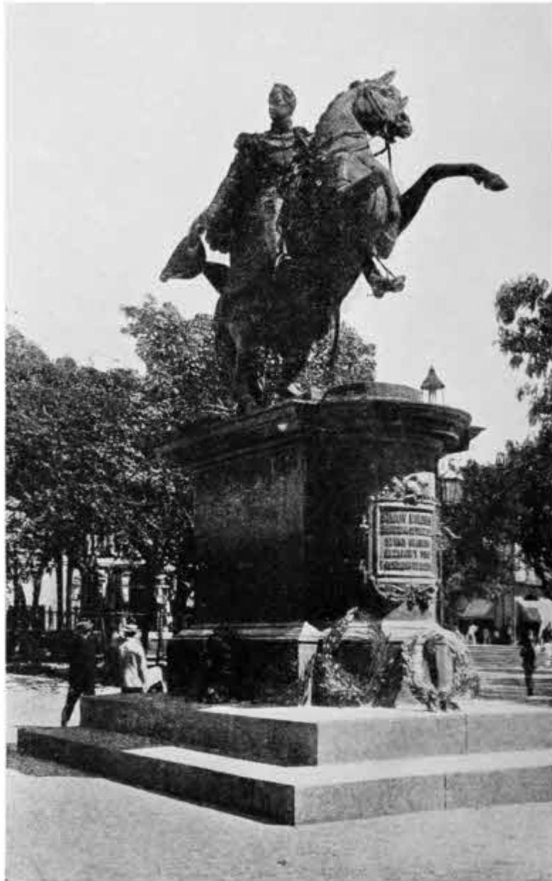
BRONZE STATUE OF BOLÍVAR IN THE PLAZA, CARÁCAS, VENEZUELA.