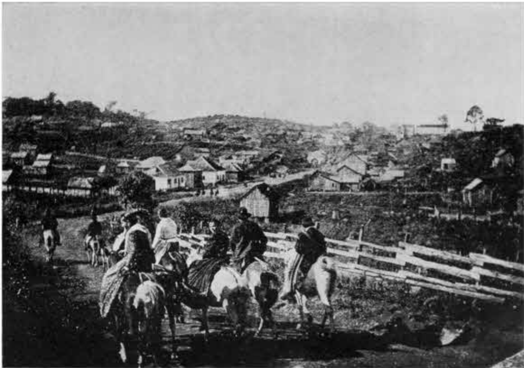
A COLONY, RIO GRANDE.

It is seen that the Brazilian has a strong leaning towards the exercise of the intellectual gifts of mankind. They are philosophical. The love of scientific and learned titles is strong. The doctorate—of laws, literature, medicine, science—has been a coveted distinction, indeed has been carried out to become a weakness or failing, a passion, as among all Latin American communities. At one time the ambition of every family capable of affording a superior education to its sons was that the boy should be a priest. That passed, and then he was to be a doctor, in one of the professions, and, moreover, to marry the daughter of a neighbour who was also a member of the learned class. Nearly all professions, it is to be recollected, in the Latin communities carry the doctorate with them. Nearly all statesmen are doctors—when they are not military men, and then the sword is apt to oust the diploma!