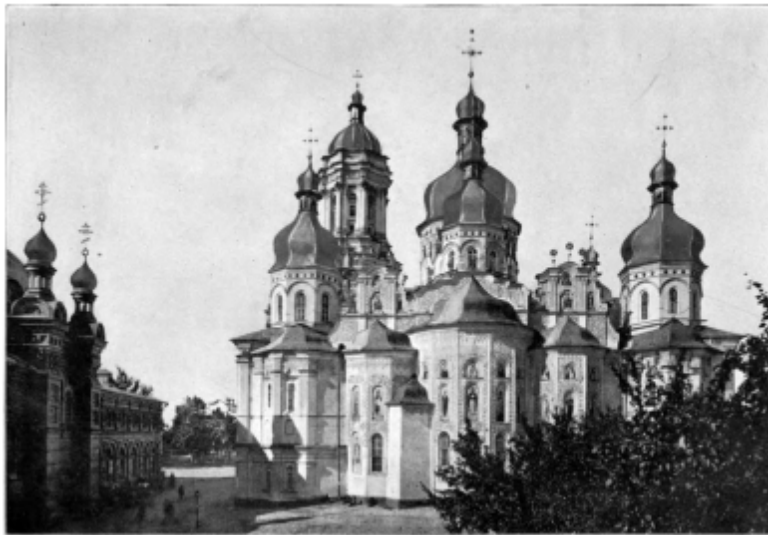
CHURCH OF THE CATACOMBS MONASTERY AT KIEV.