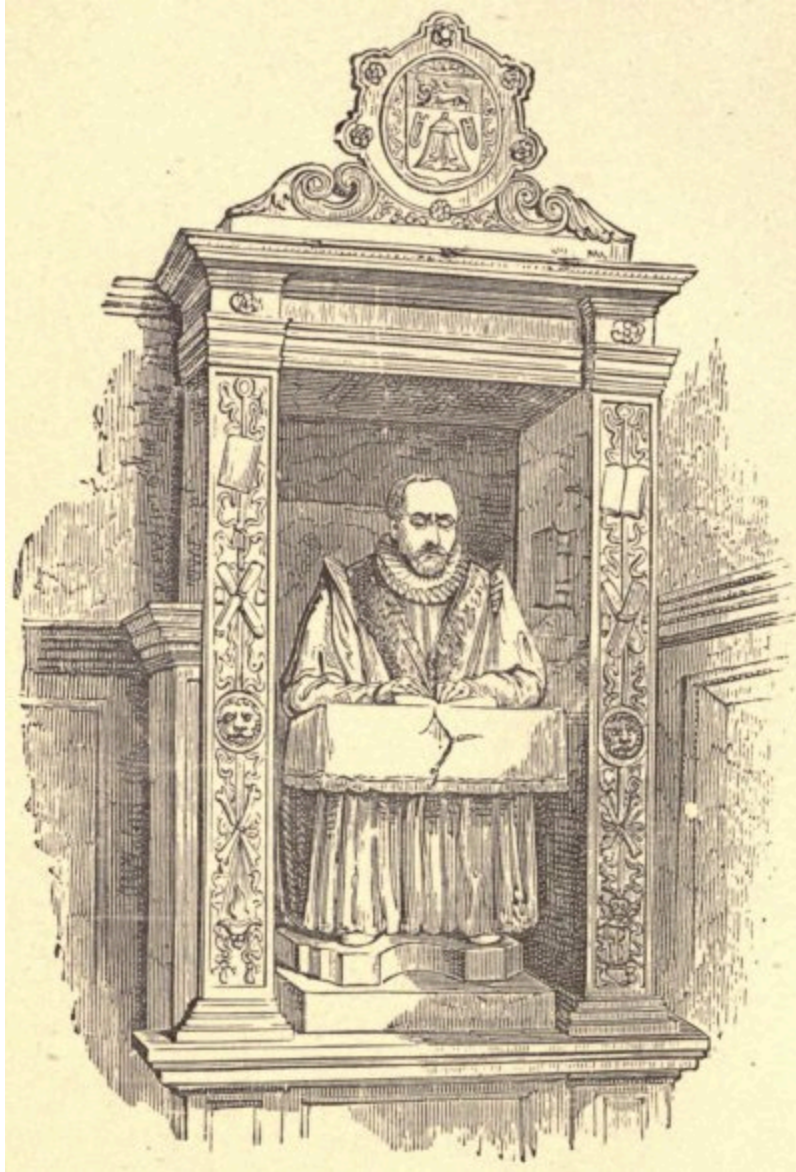
STOW'S MONUMENT, IN THE CHURCH OF ST. ANDREW UNDERSHAFT, LONDON.