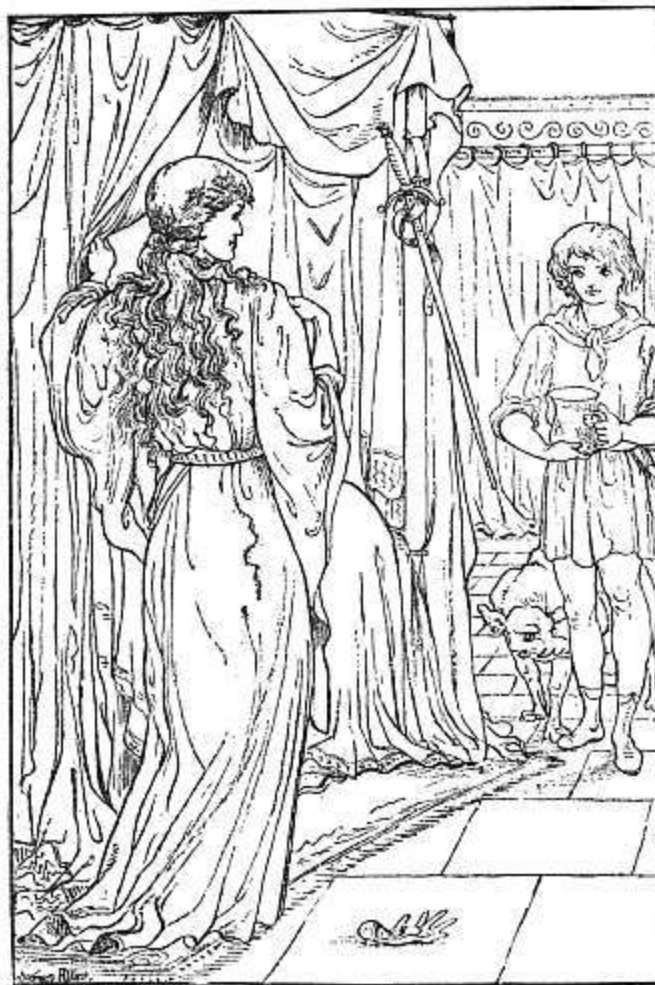
Curdie brings wine to the king.

In the servants' hall the girl still sat by the fire, waiting for him. As he returned he told her to follow him, and left her at the chamber door till he should rejoin her.